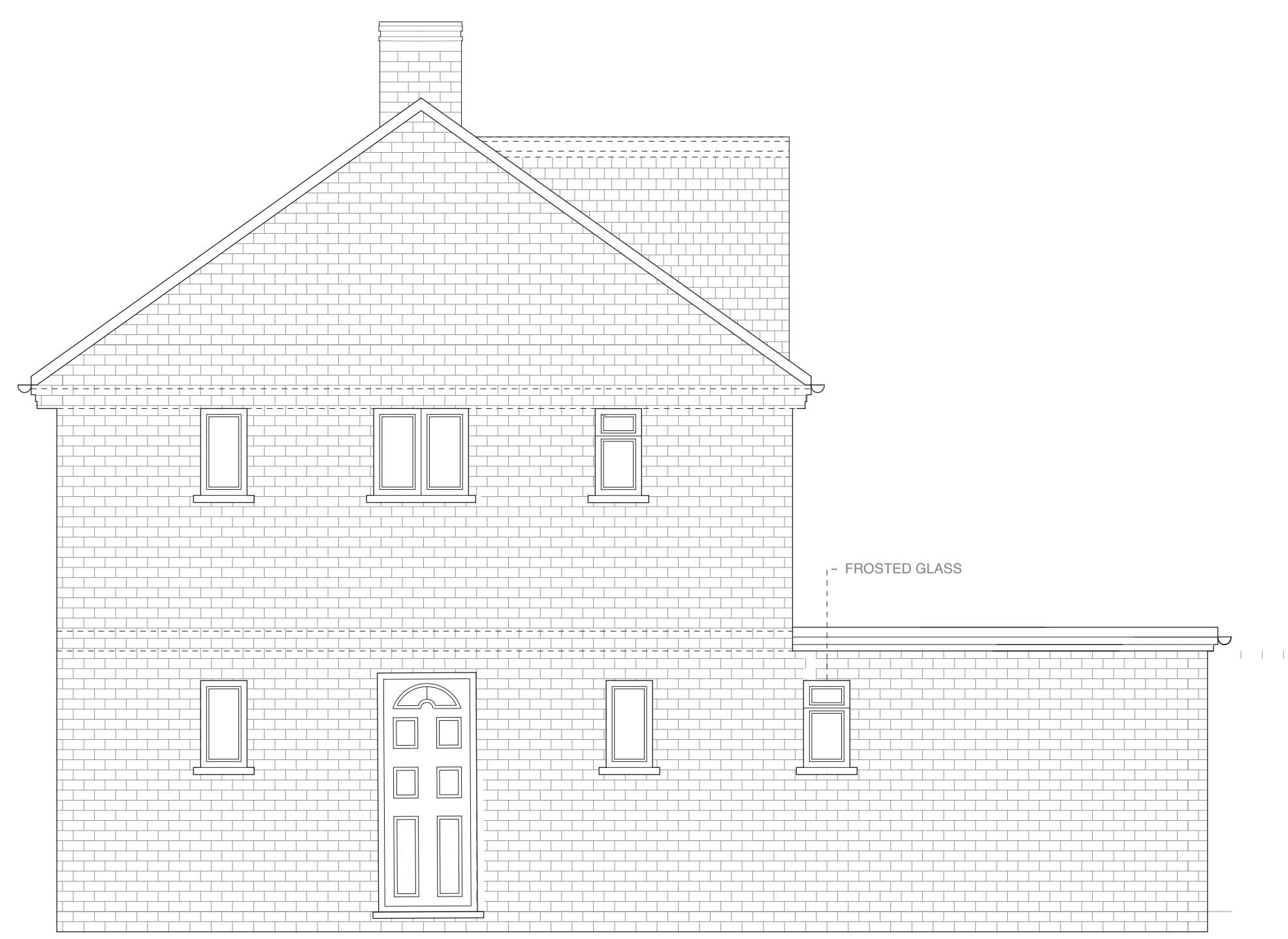
PROPOSED SIDE ELEVATION A