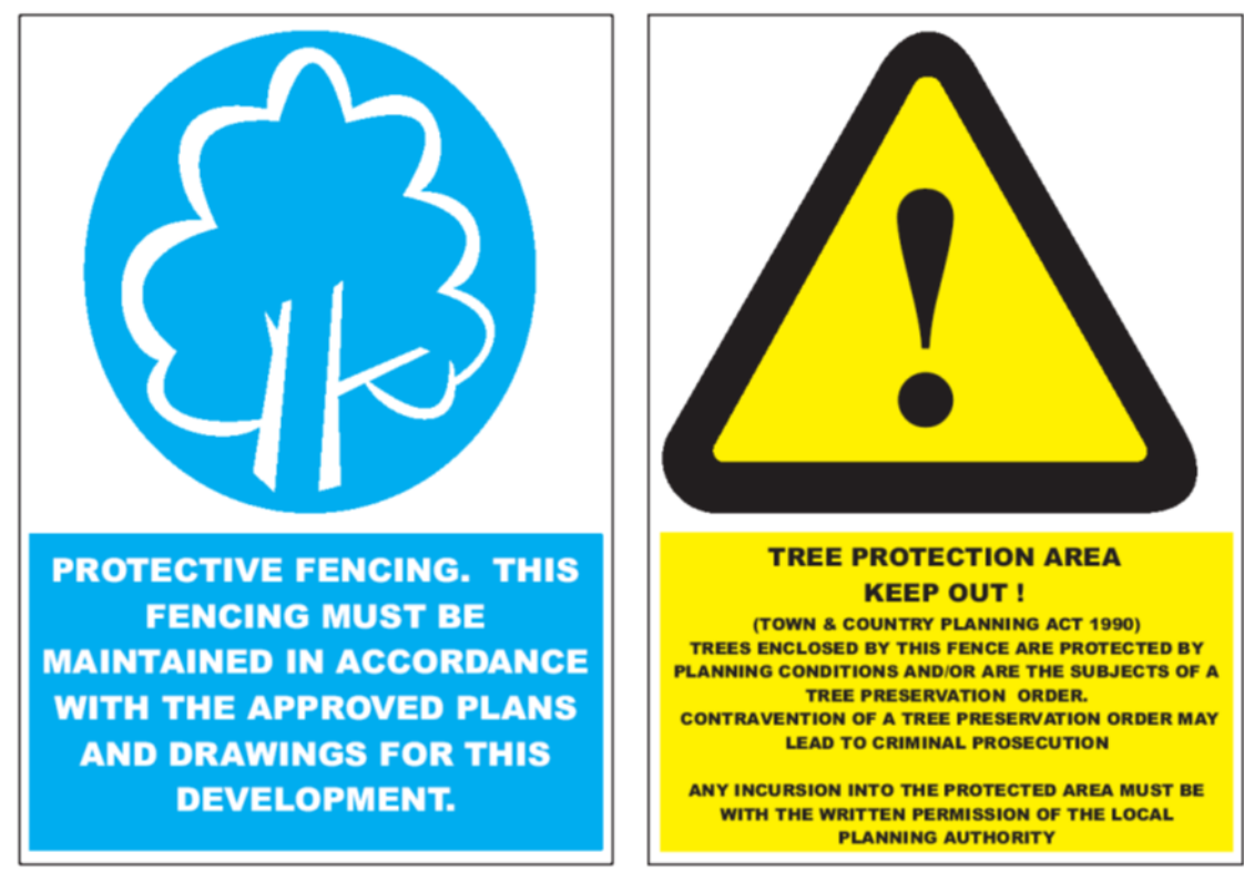
Fig. 1. Example of protective fencing and signage:

It must be ensured that wide or tall loads or plant with booms, jibs and counterweights can deliver or operate without coming into contact with retained trees above the fencing line of the construction exclusion zone. Such contact can result in serious damage to the trees and might make their safe retention impossible. Any transit or traverse of plant in close proximity to trees should be conducted under the supervision of a banksman to ensure that adequate clearance from trees is maintained at all times. In some circumstances it may be possible to maintain adequate clearance thus necessitating access facilitation pruning.