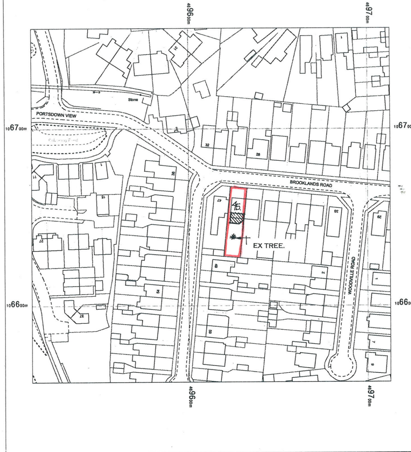
SITE/LOCATION PLAN AMENDED DEC 2023 ( CORNER SPLAY )