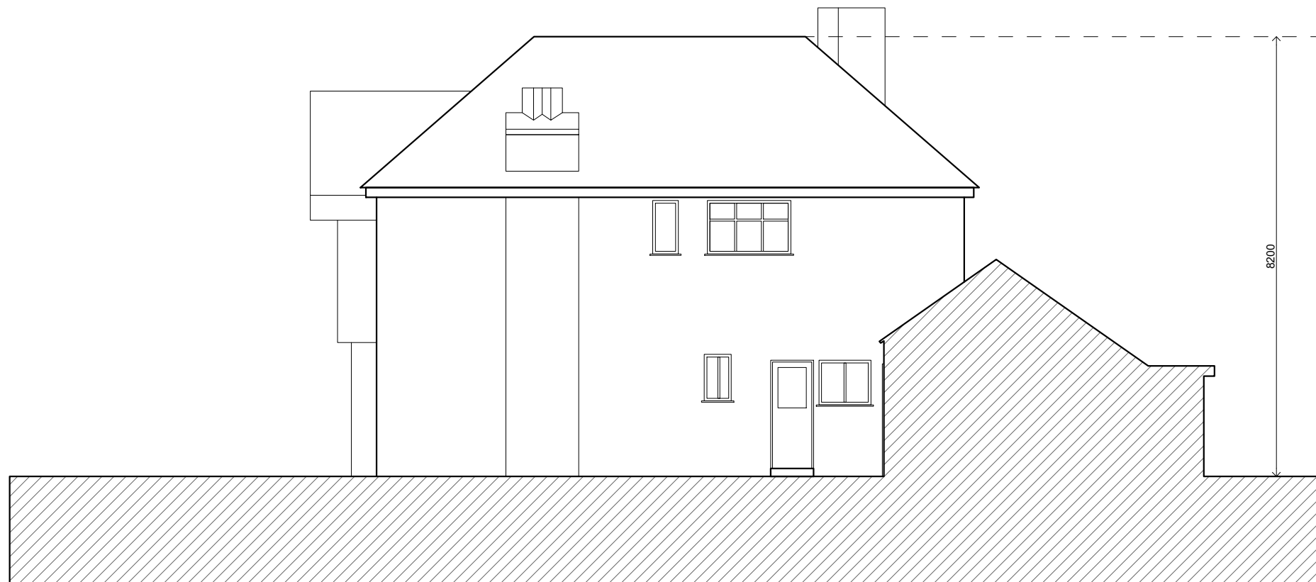
SIDE ELEVATION As seen from 73 The Ridgeway

GENERAL NOTES: USE FIGURED DIMENSIONS ONLY. DO NOT SCALE OFF DRAWINGS. ALL DIMENSIONS ARE TO BE CHECKED ON SITE. INCONSISTENCIES ARE TO BE REPORTED TO OATEN ARCHITECTS IMMEDIATELY.