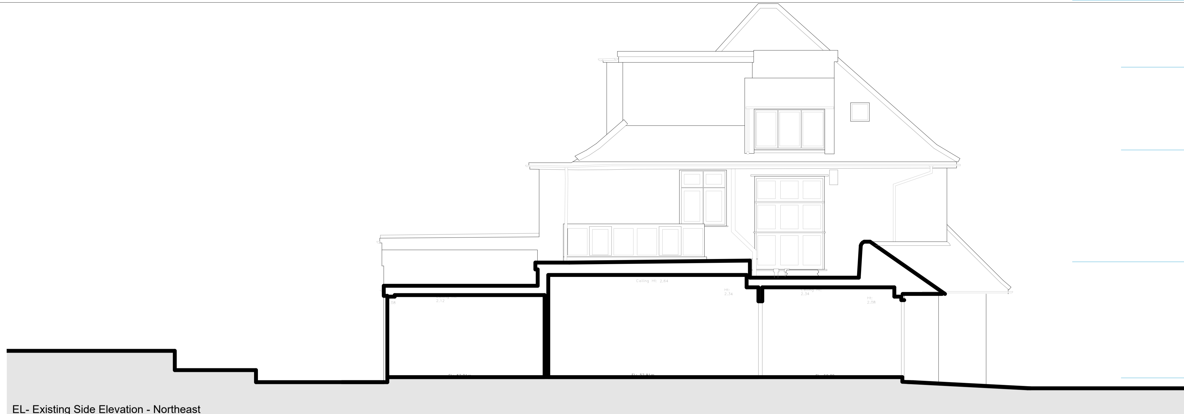
EL- Existing Side Elevation - Northeast 1:50