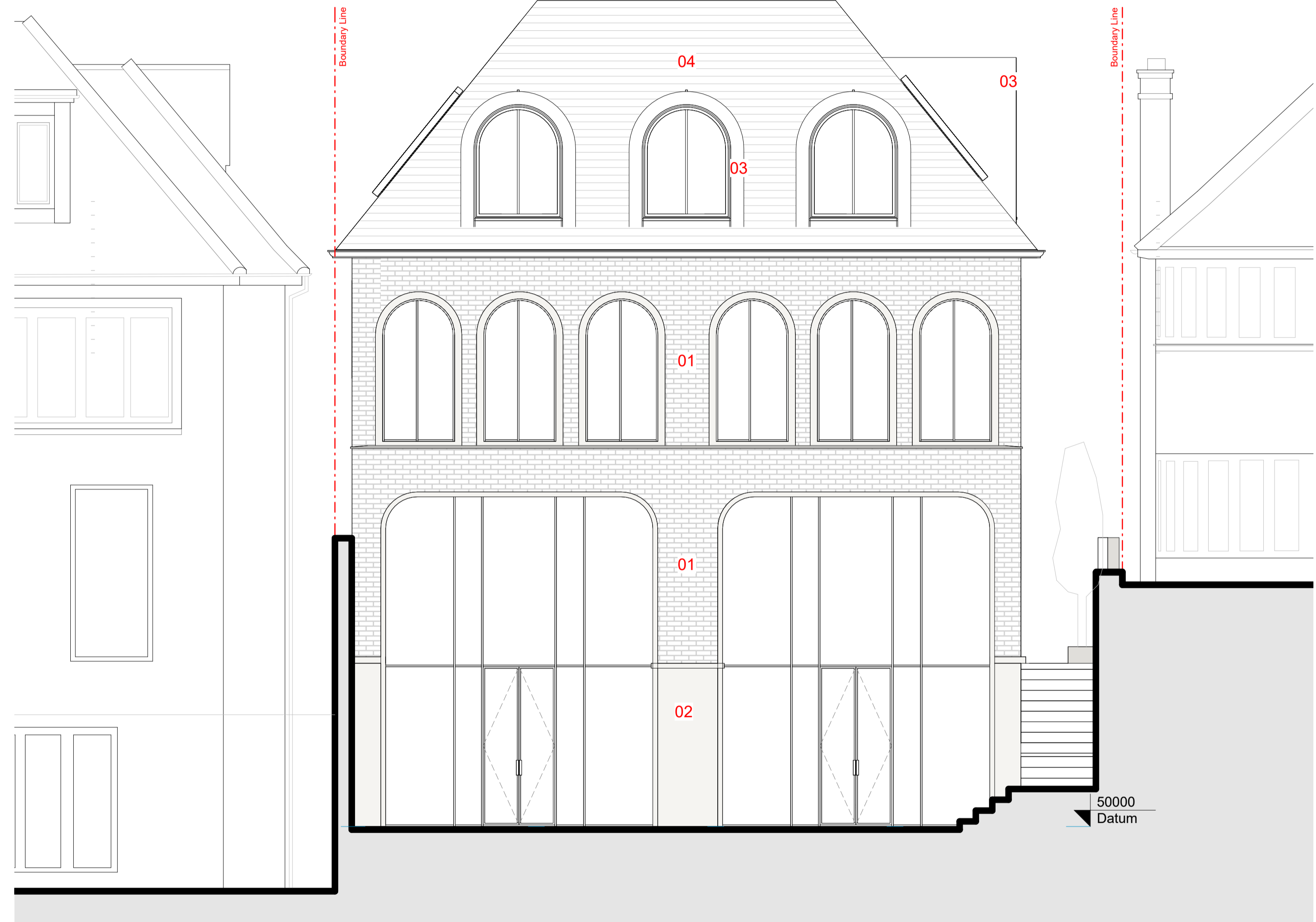
EL - Proposed Rear Elevation