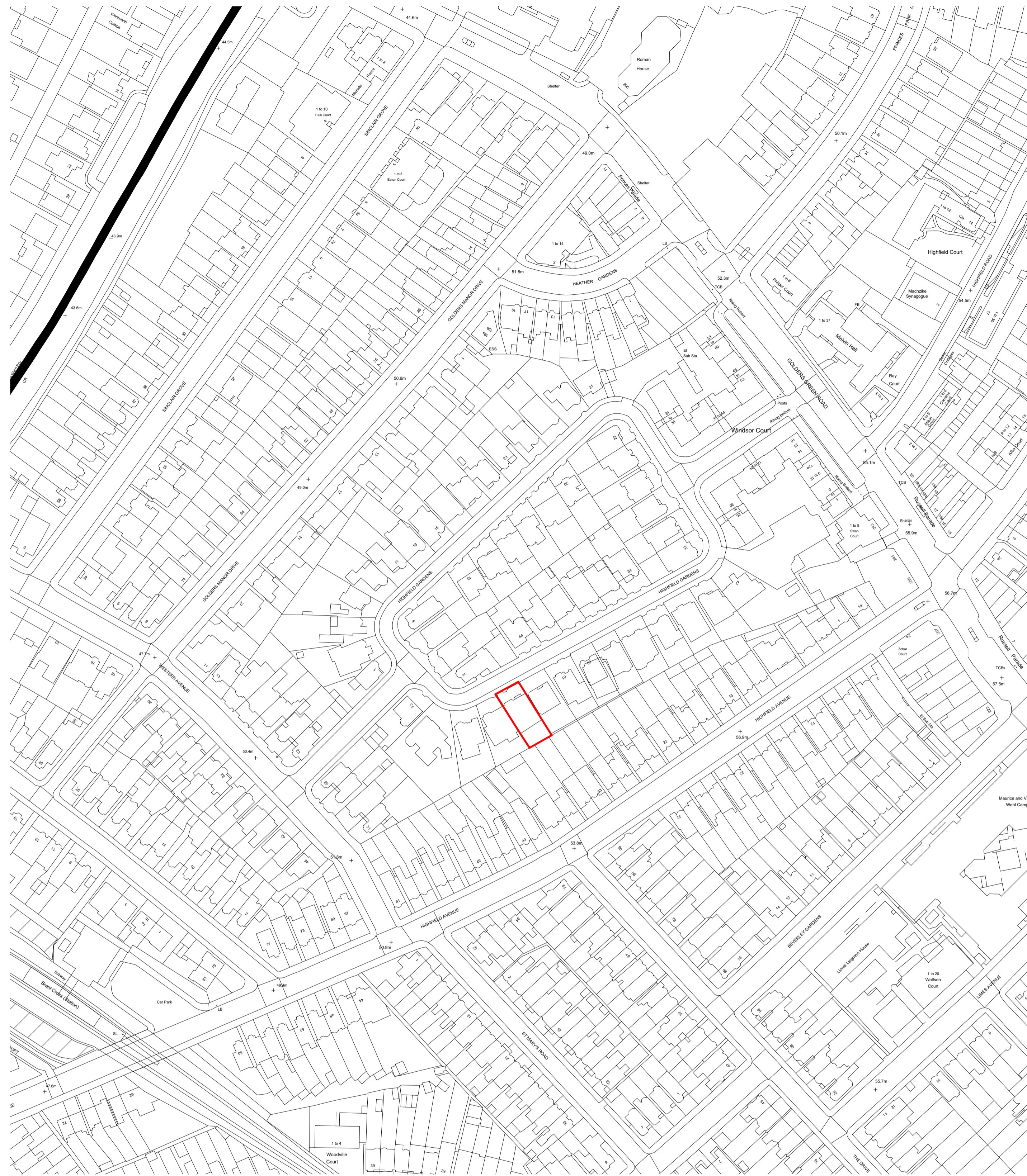
LP - Location Plan 1 : 1250