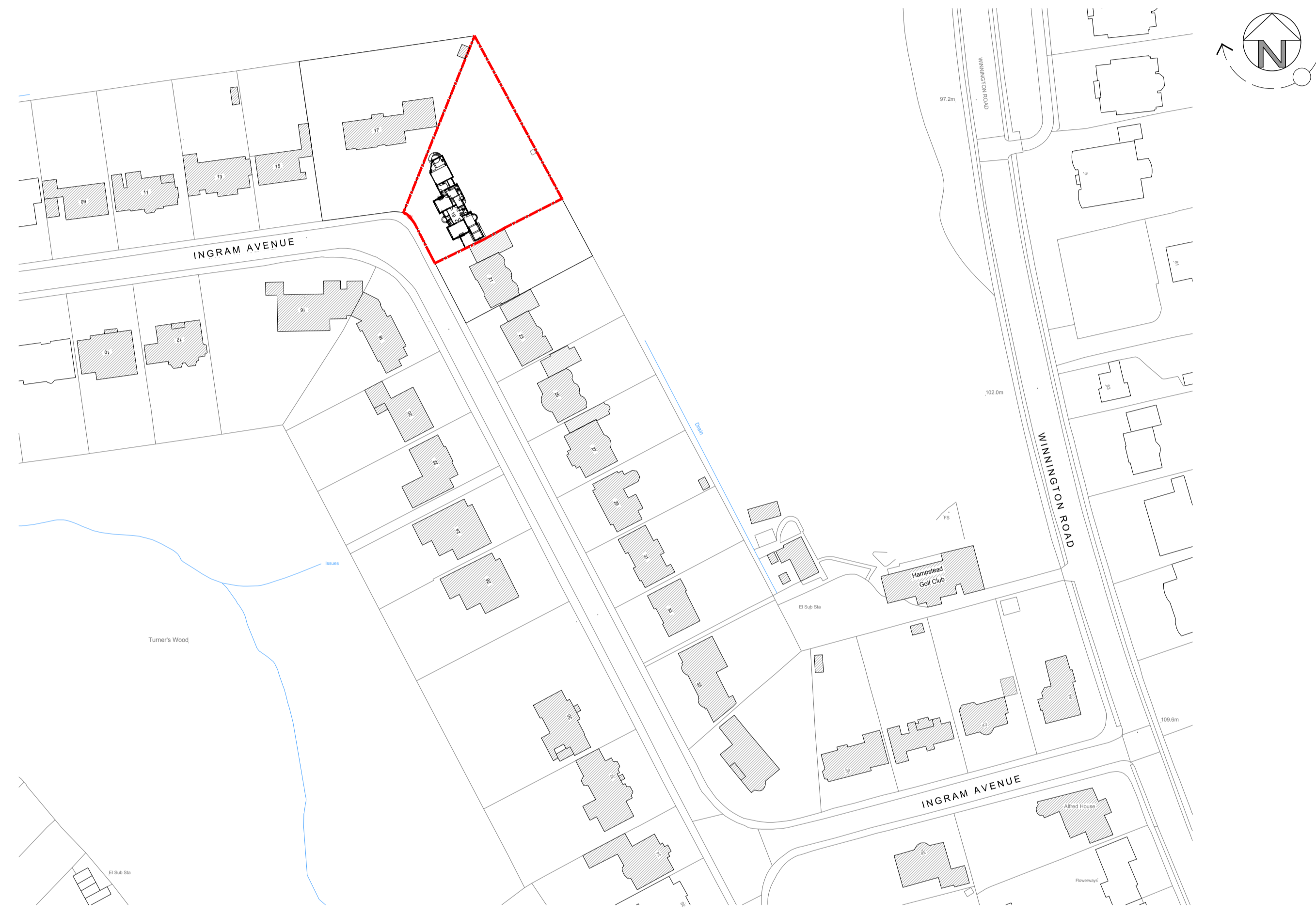
Location Plan (1:1250)