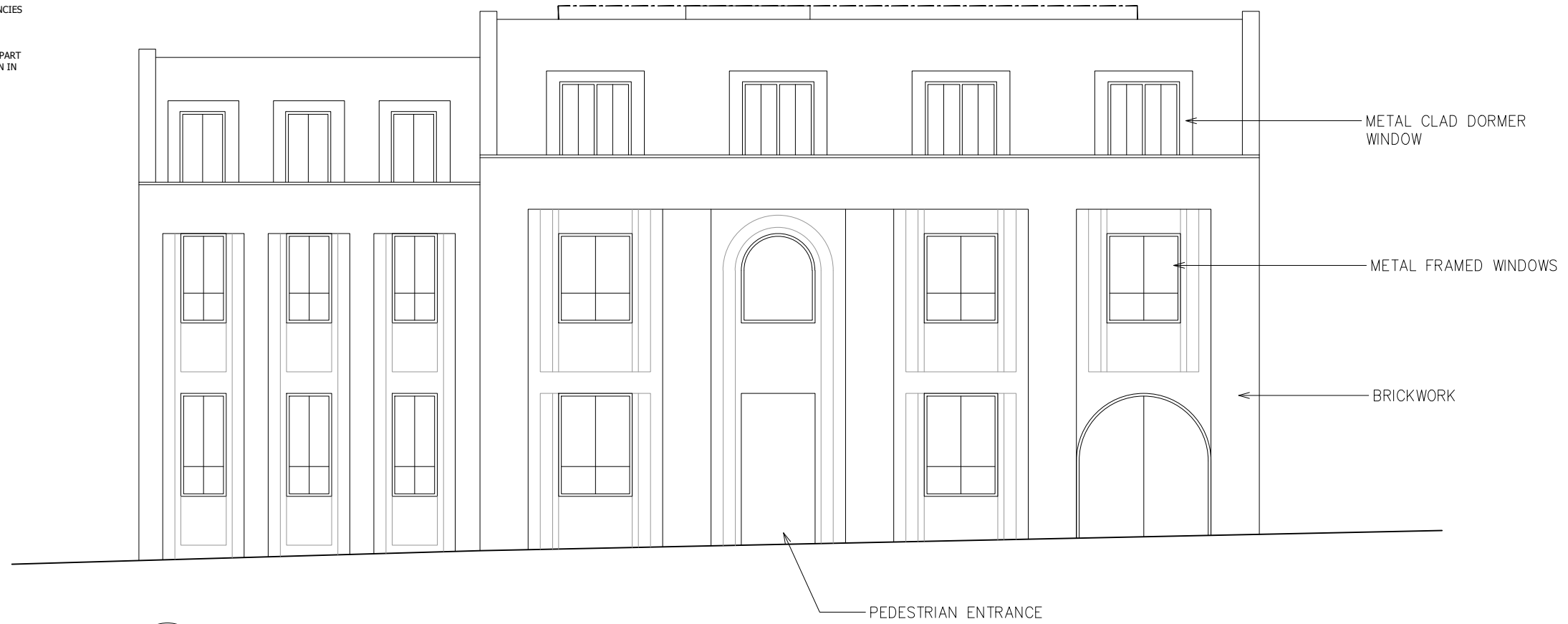
1 EXISTING SOUTH ELEVATION 1 : 100

THIS DRAWING AND ANY DESIGNS INDICATED THEREON ARE THE COPYRIGHT OF THE ARCHITECT. ALL RIGHTS ARE RESERVED. NO PART OF THIS WORK MAY BE REPRODUCED WITHOUT PRIOR PERMISSION IN WRITING FROM THE ARCHITECT.