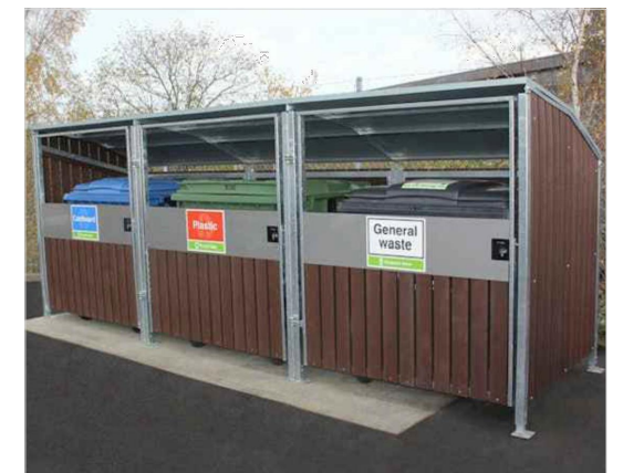
Proposed style for bin store