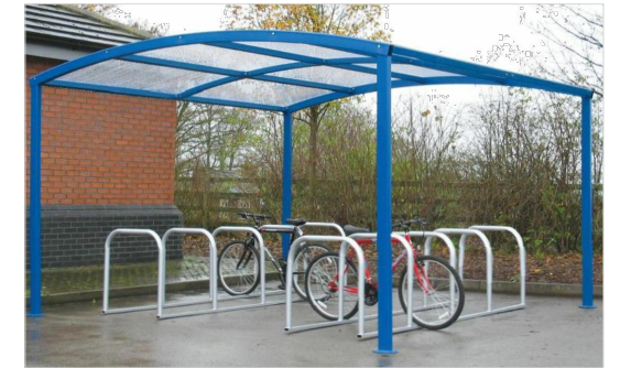
Proposed style for canopy and cycle hoops