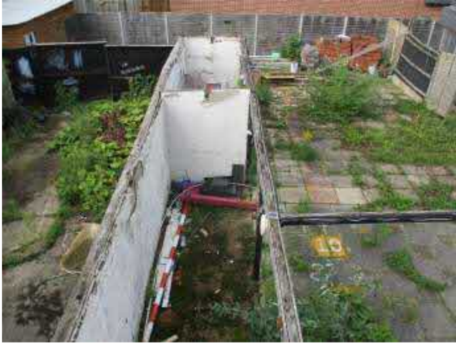
Outbuildings and garden area