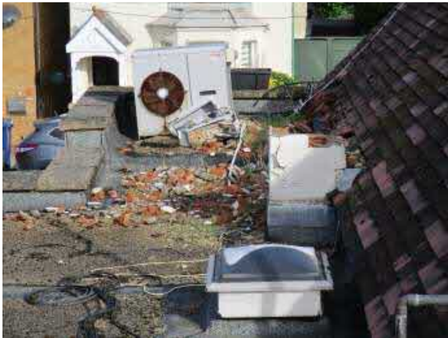
Collapsed chimney on flat roof