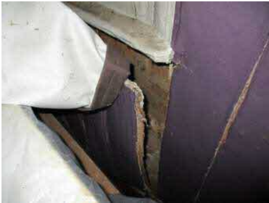
Damaged panelling in bar area