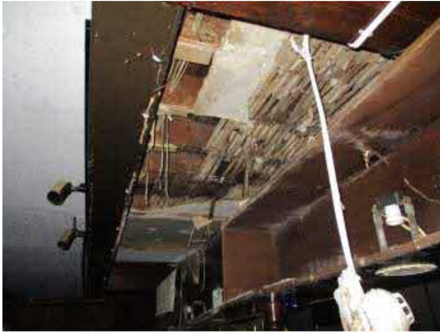
Water damaged ceiling above bar