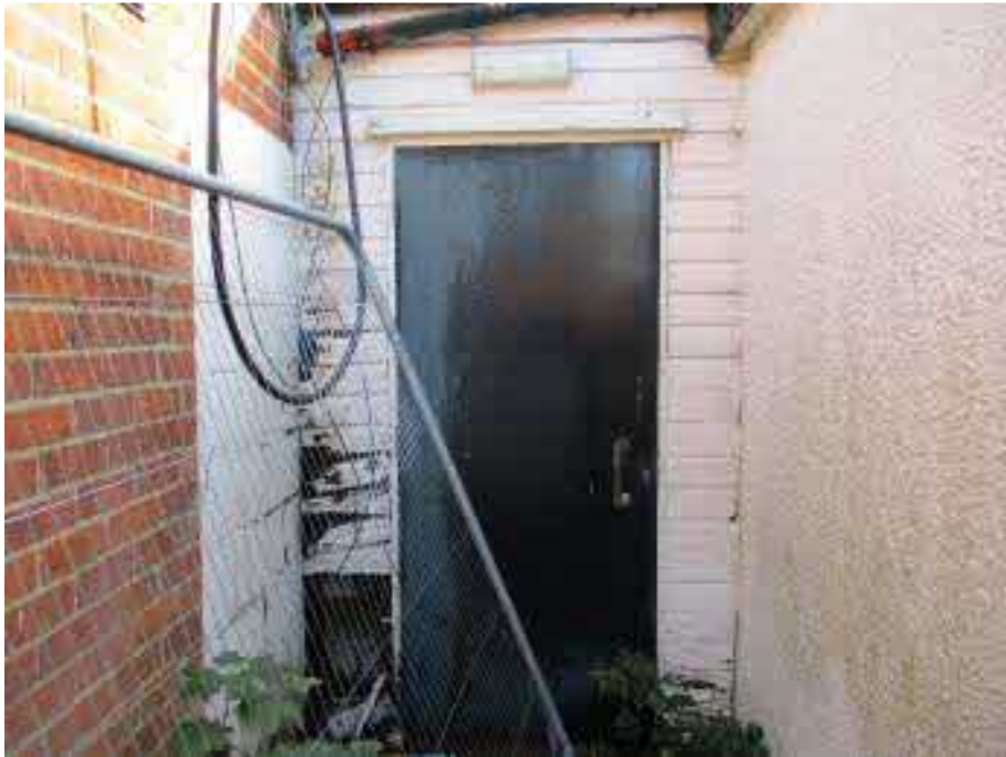
Rotten side entrance