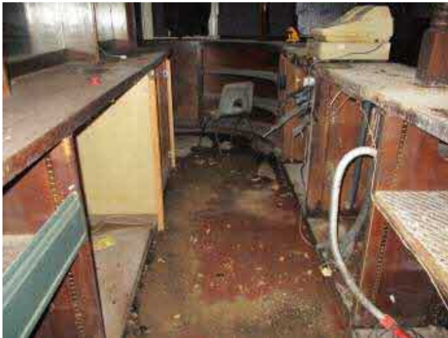
Bar server area