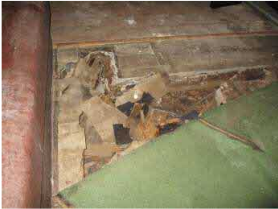
Collapsed bar floor