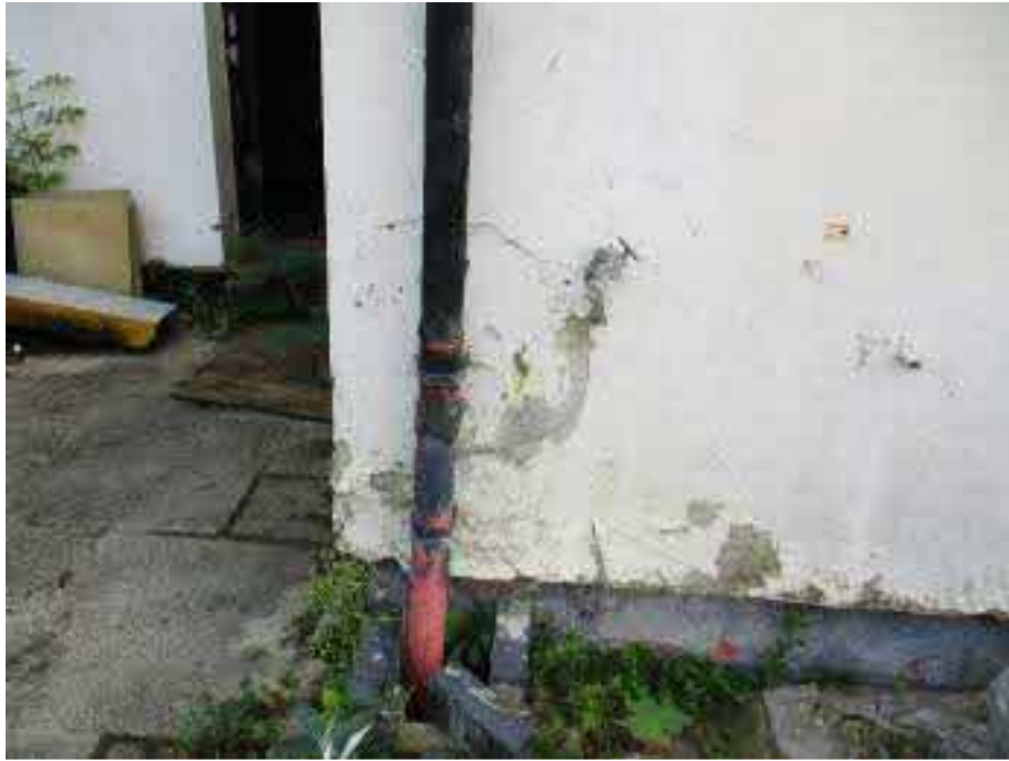
Blocked and leaking downpipe and loose render