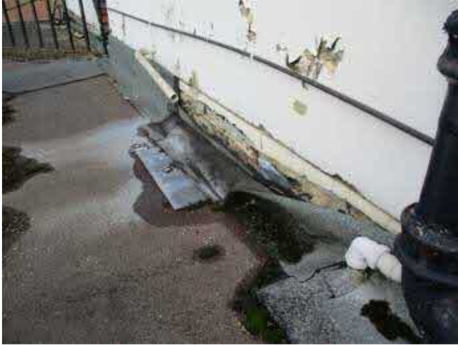
Flashing pulled away