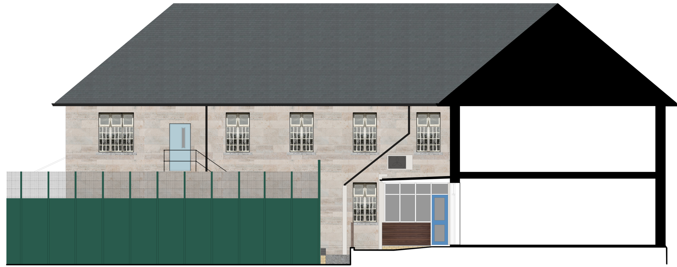
01- North West Elevation