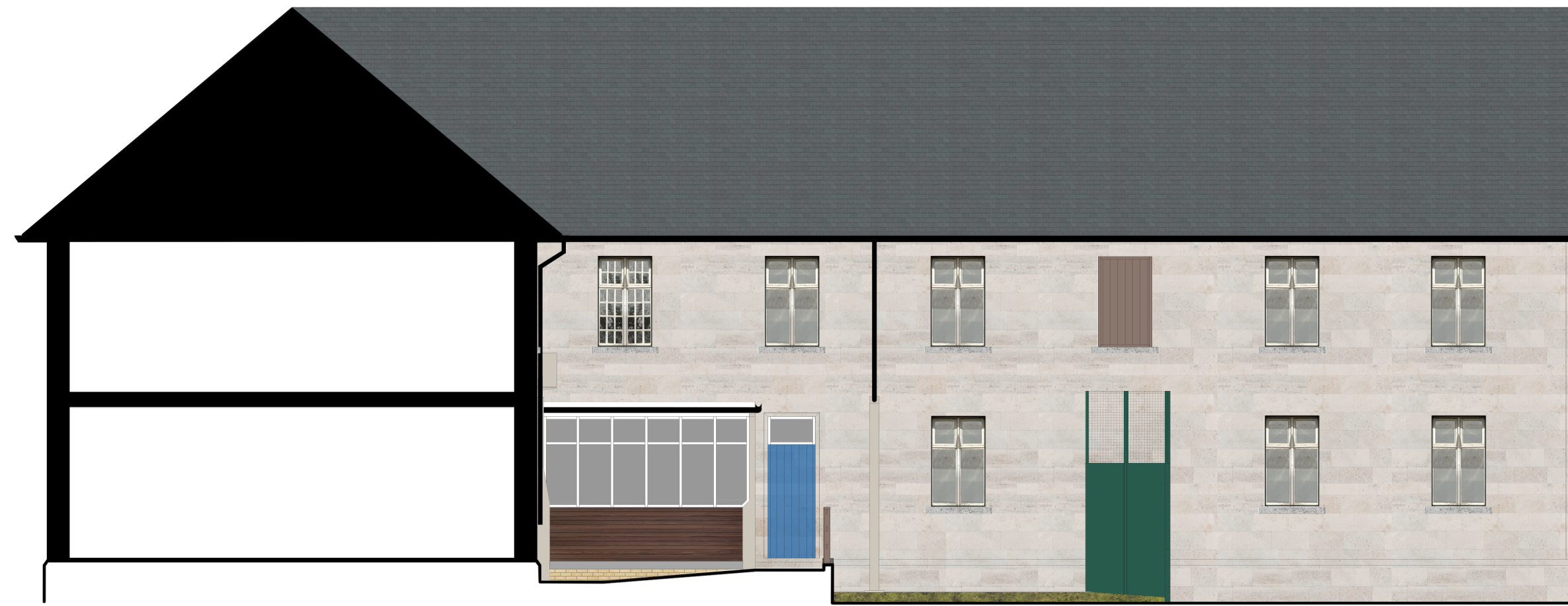
03- North East Elevation