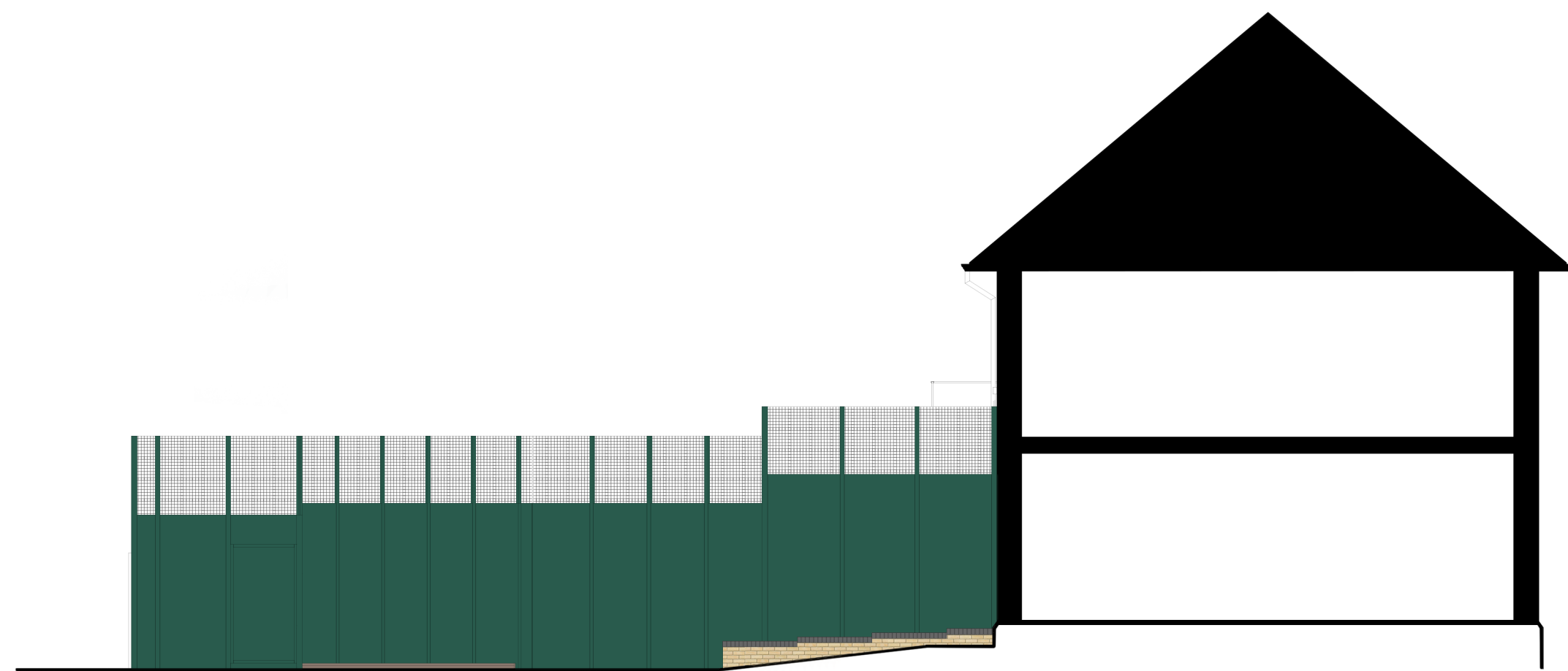
05- South West Elevation