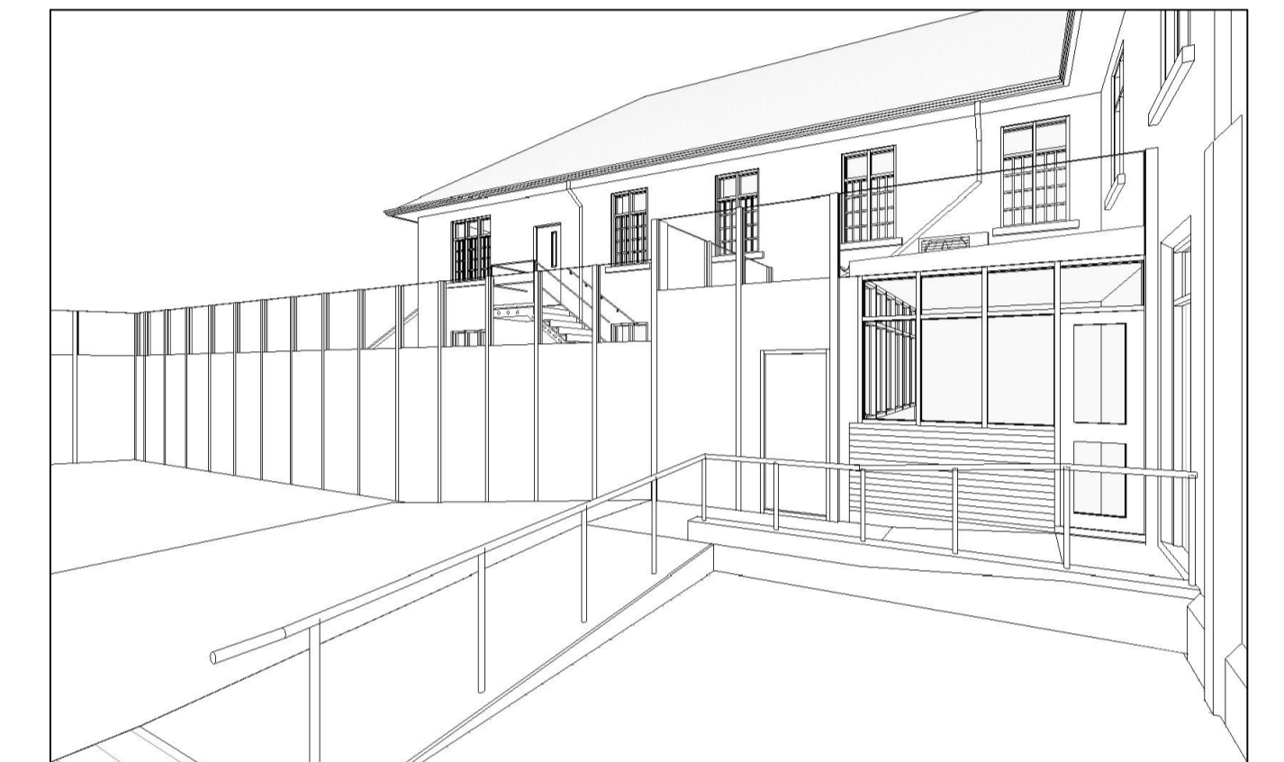
03 - proposed view from the garden towards the north west elevation