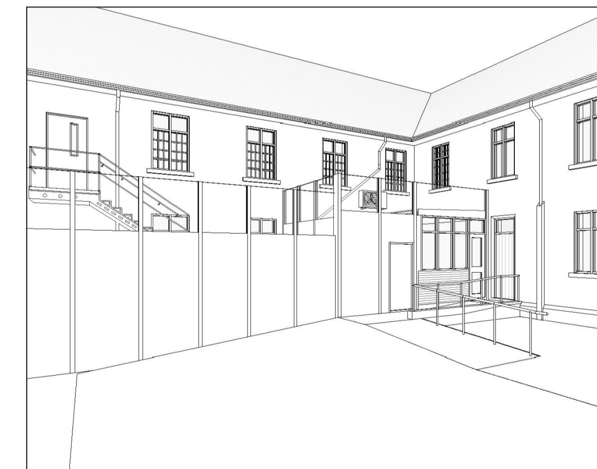
04 - proposed view from the garden towards the north west & north east elevations