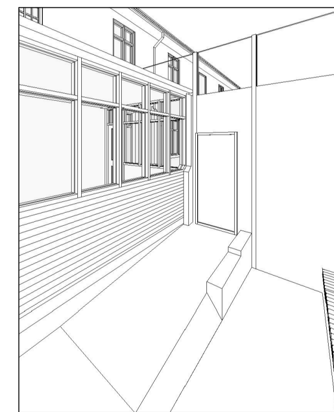
02 - proposed view from the entrance ramp toward the south east