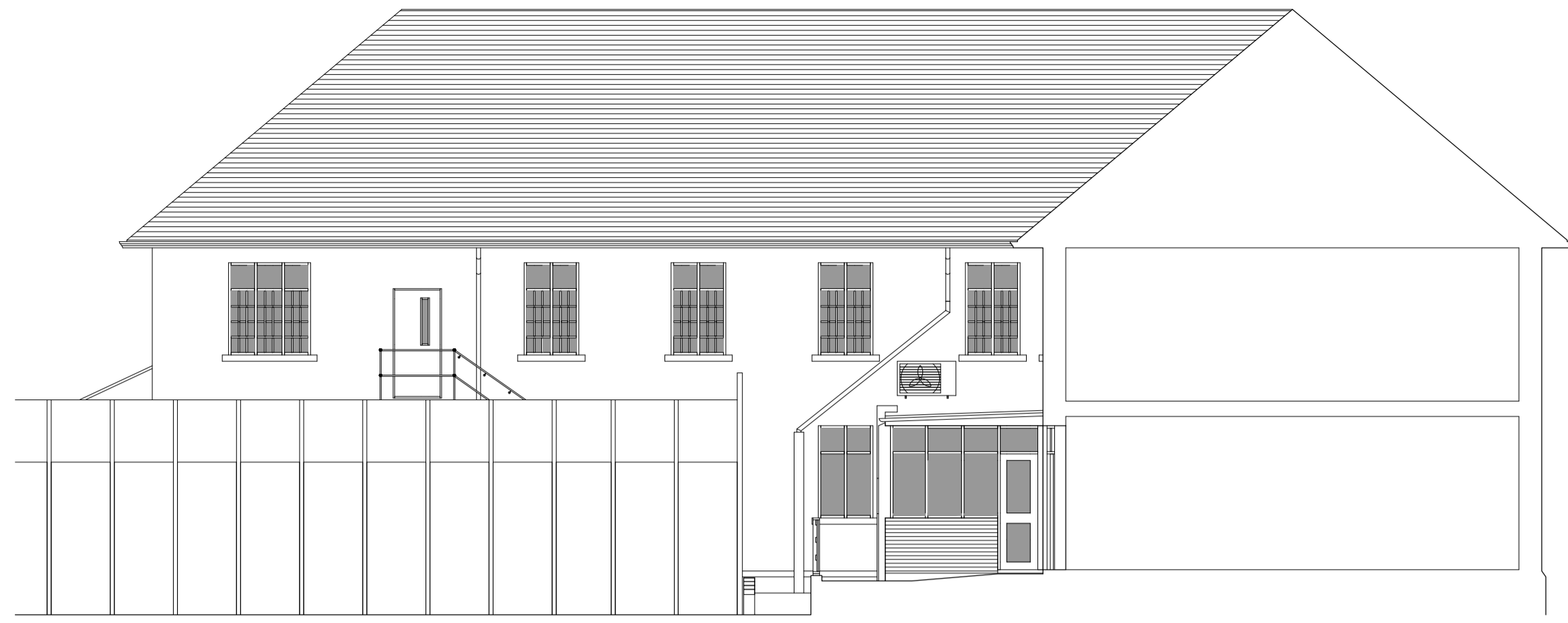
01- North West Elevation