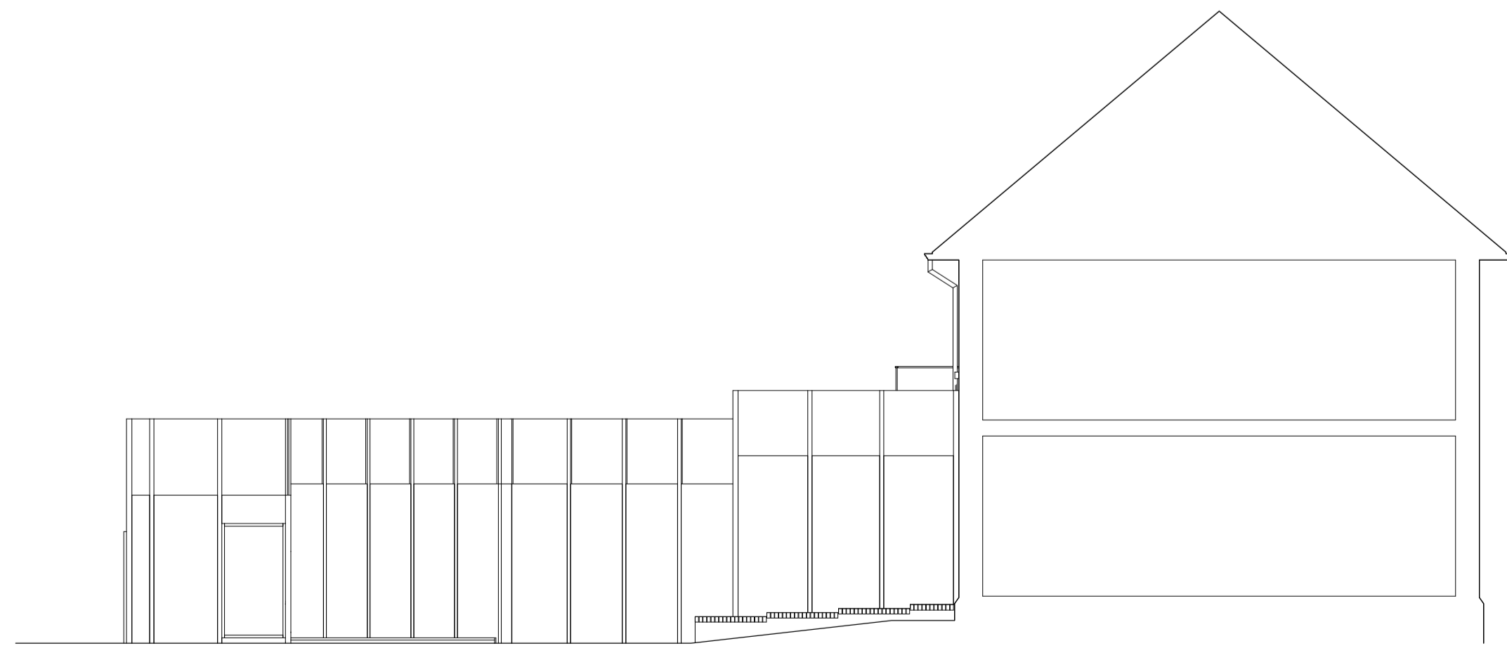
05- South West Elevation