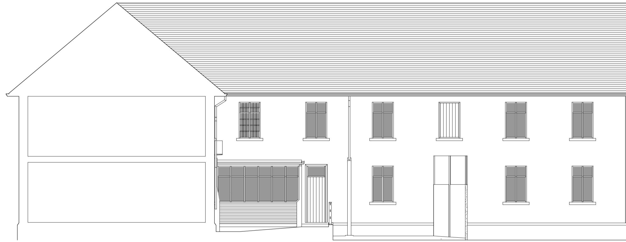
03- North East Elevation