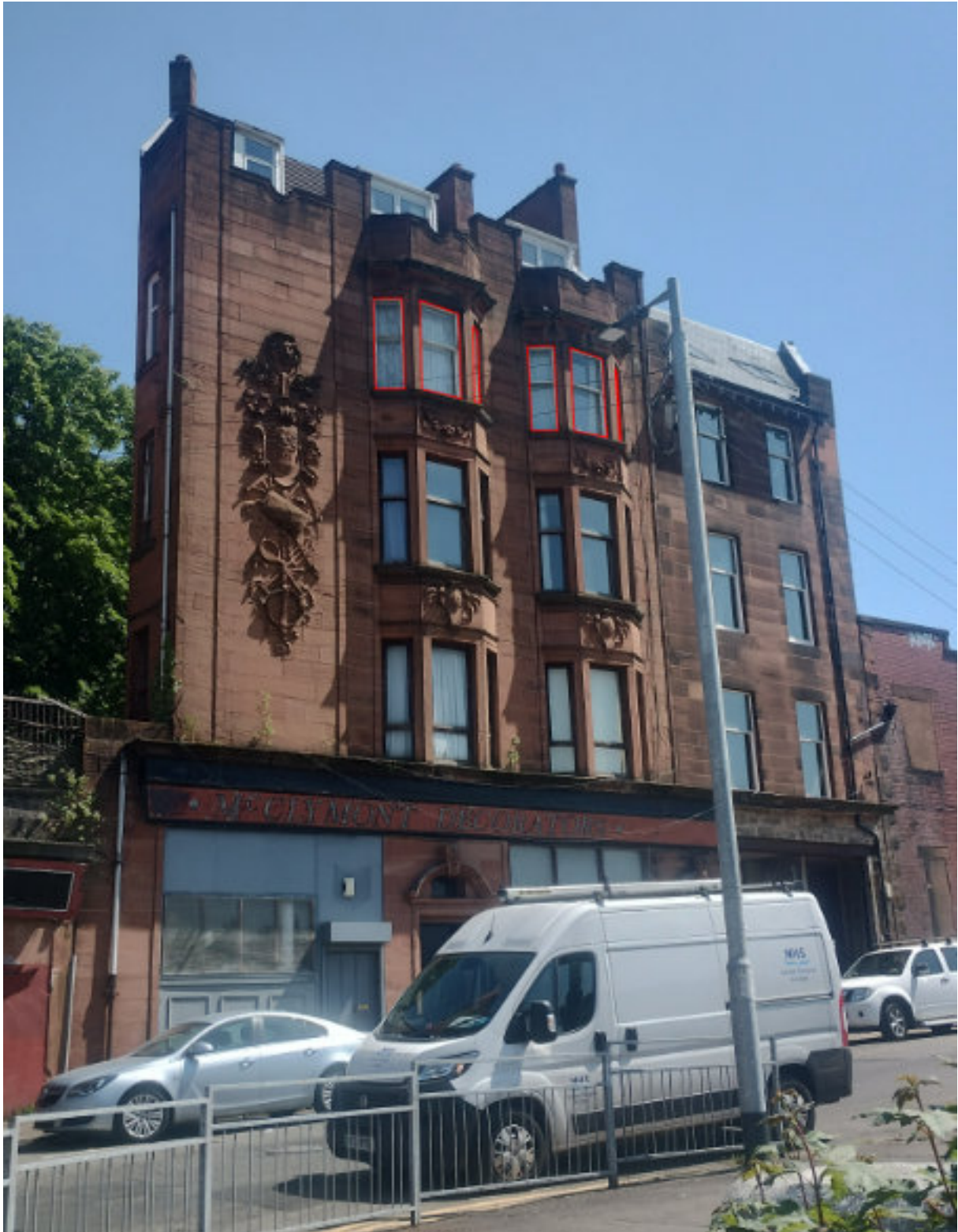
Exterior of 208 Hunter Street, with applicant's windows highlighted in red