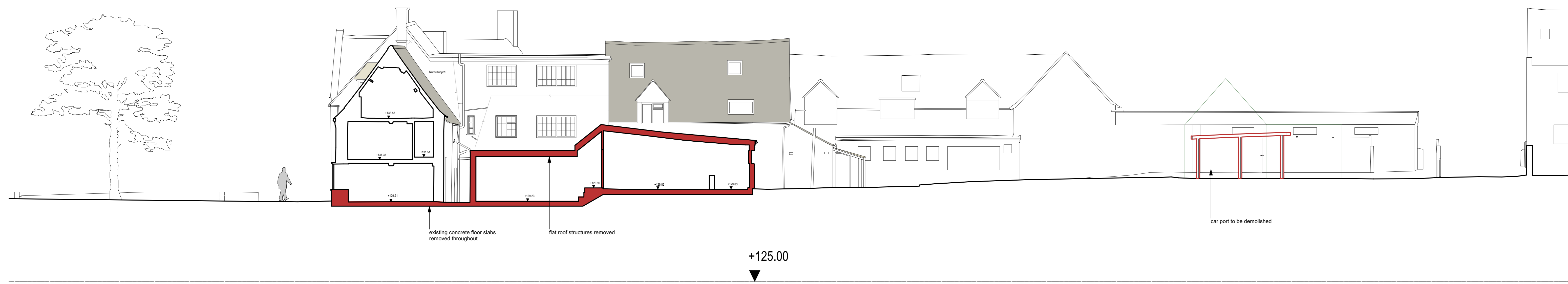
SECTION F - F