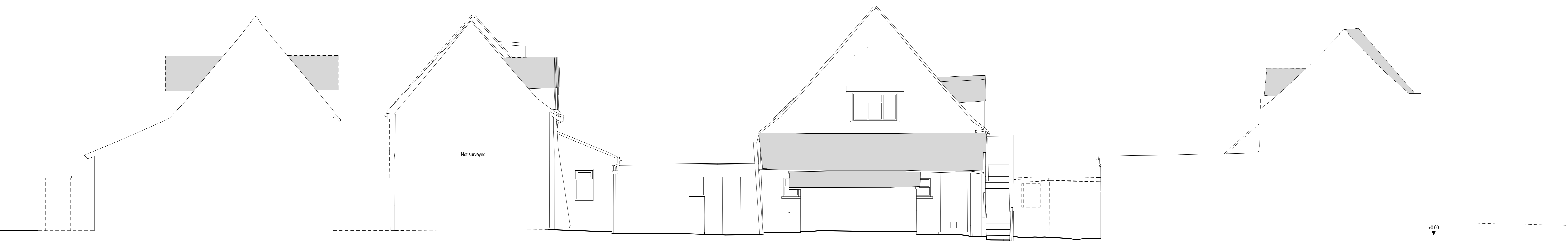
3 Existing elevation 3 1 : 50

Notes - All information contained in this drawing should be checked and verified prior to any fabrication or construction. - Any discrepancies between this drawing and any other information should be reported to Measured Survey Pro within 60 days after the native CAD DWG drawings are released.