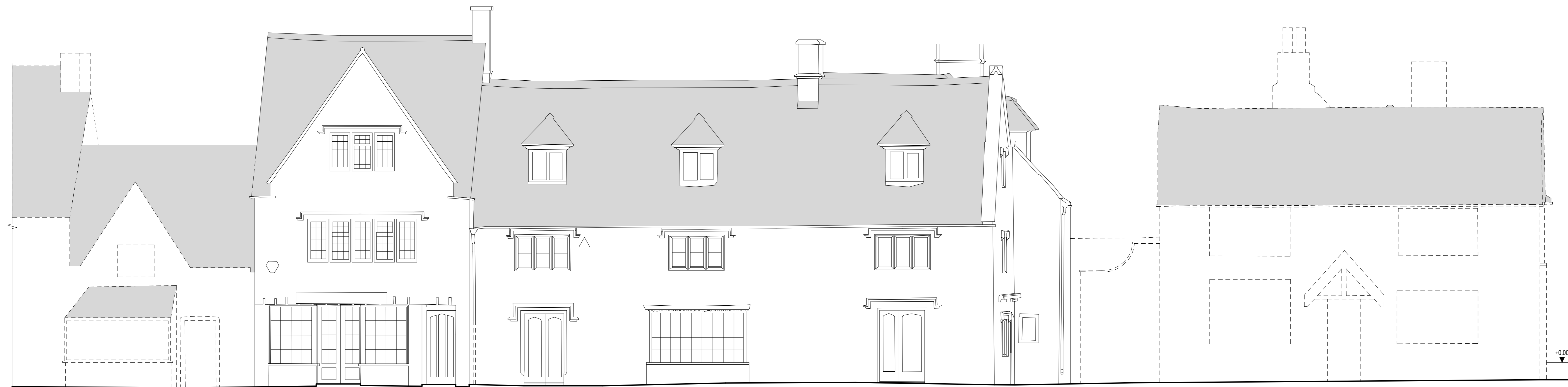
1 Existing elevation 1 1 : 50