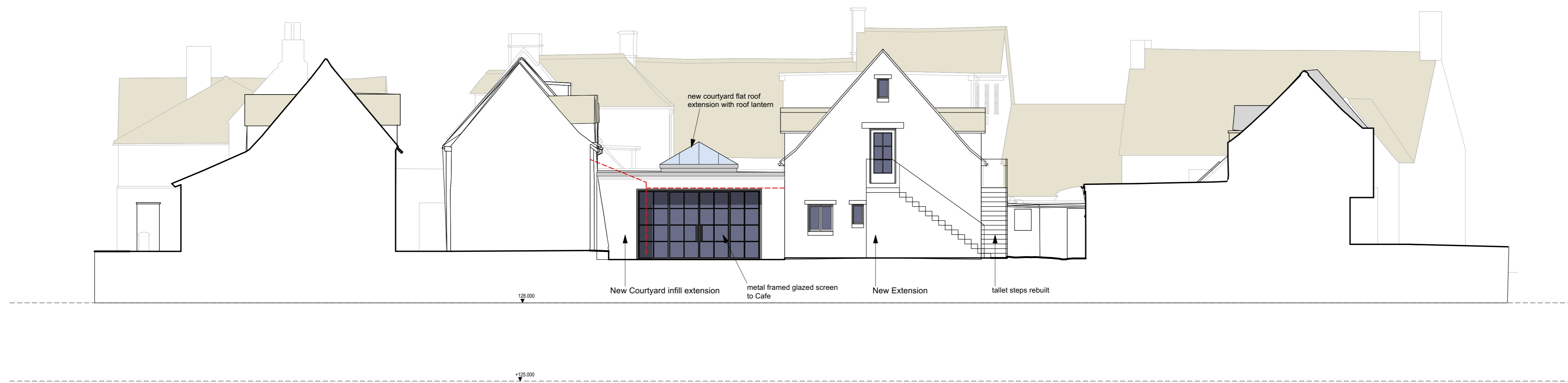
North-East Courtyard Elevation