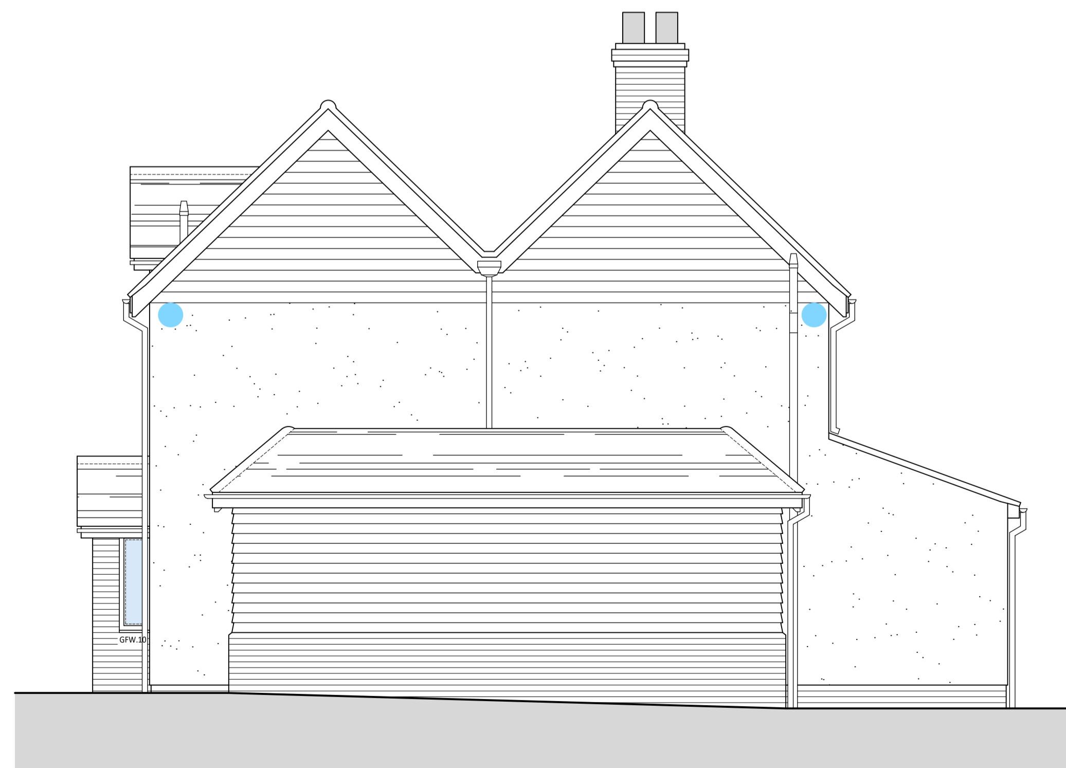
SIDE ELEVATION SCALE 1:50