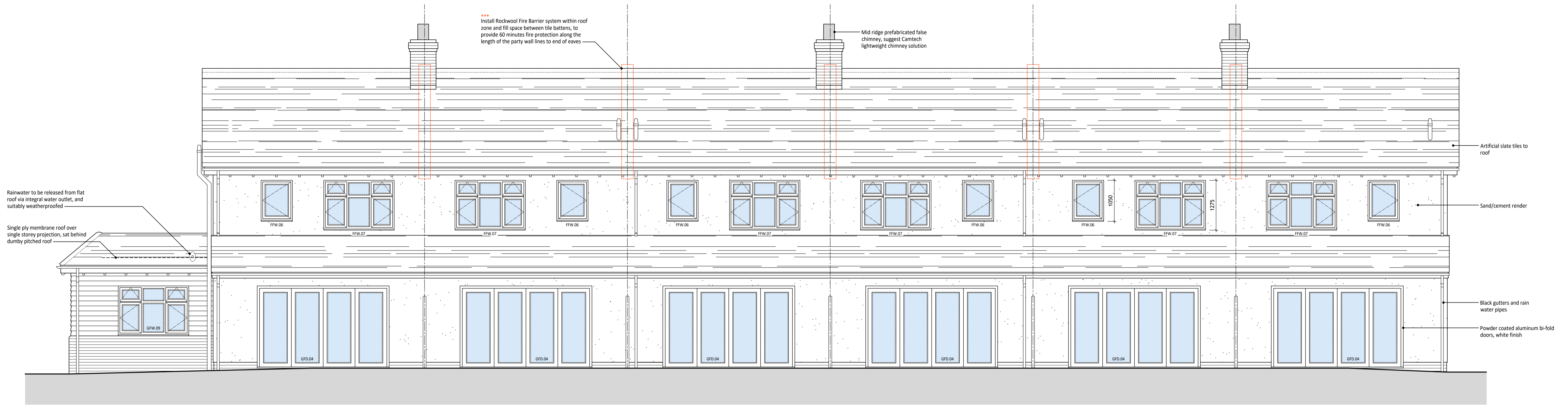
REAR ELEVATION SCALE 1:50

General: This drawing is the copyright of More Space Architecture Ltd, which cannot be copied without prior consent. The drawing is to be read in conjunction with all other drawings, schedules and specifications, and all other relevant consultants and/or specialists' information relating to the project. All dimensions are in millimetres unless otherwise stated. Do not scale from this drawing, use figure dimensions only. All levels and dimensions to be checked on site prior to commencement of works. All discrepancies to be relayed back to More Space Architecture Ltd as soon as possible. The contractor is to comply in all respects with the current Building Regulations whether or not specifically stated on these drawings. IMPORTANT NOTE: Works to be fully compliant with the CDM 2015 Regulations.