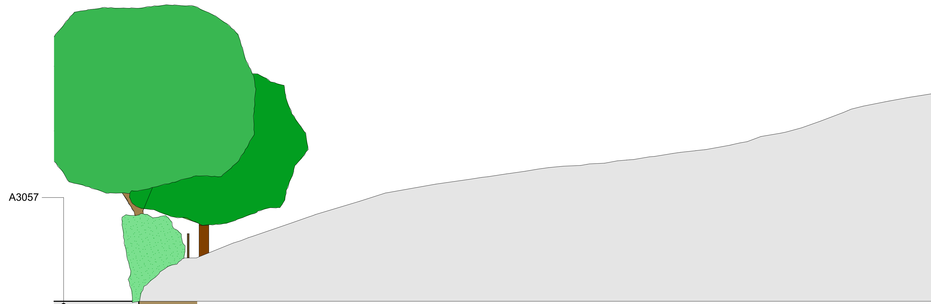
Existing Section | Scale 1:100