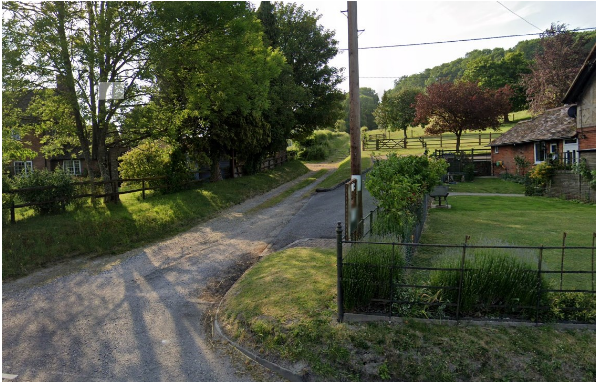
View from road 5 Brook Cottage seen in the right.