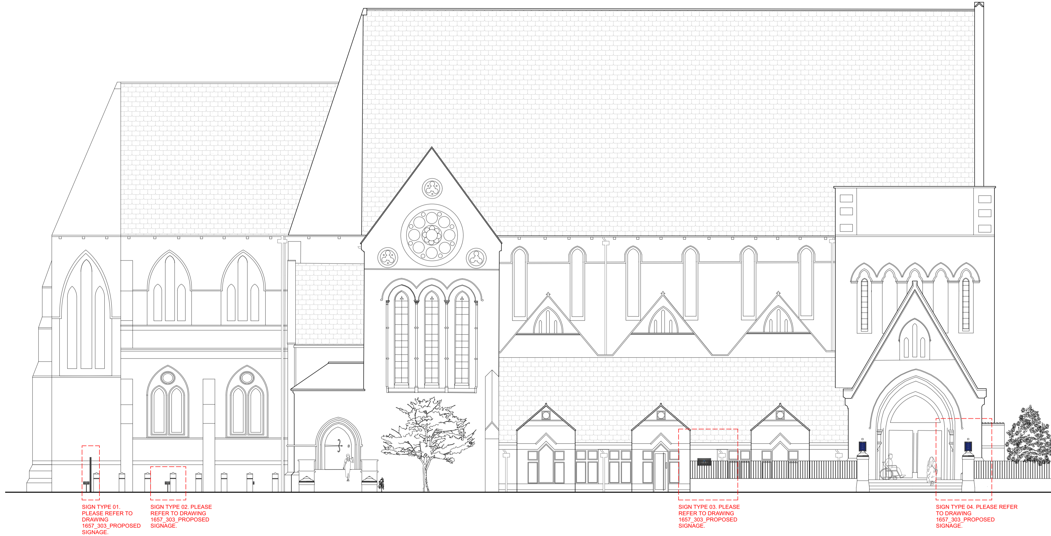
PROPOSED CLARENCE STREET ELEVATION