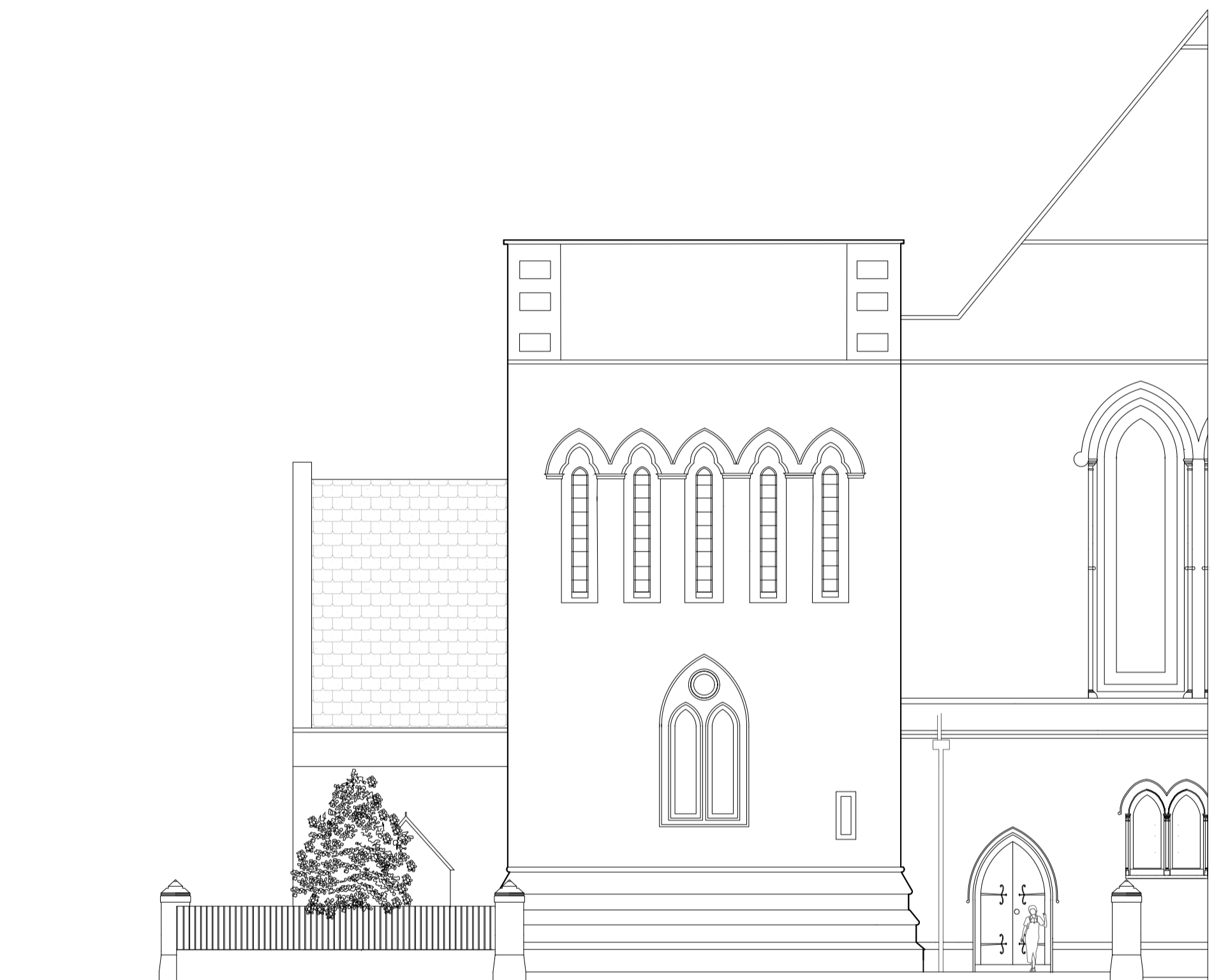
EXISTING ST GEORGE'S PLACE ELEVATION