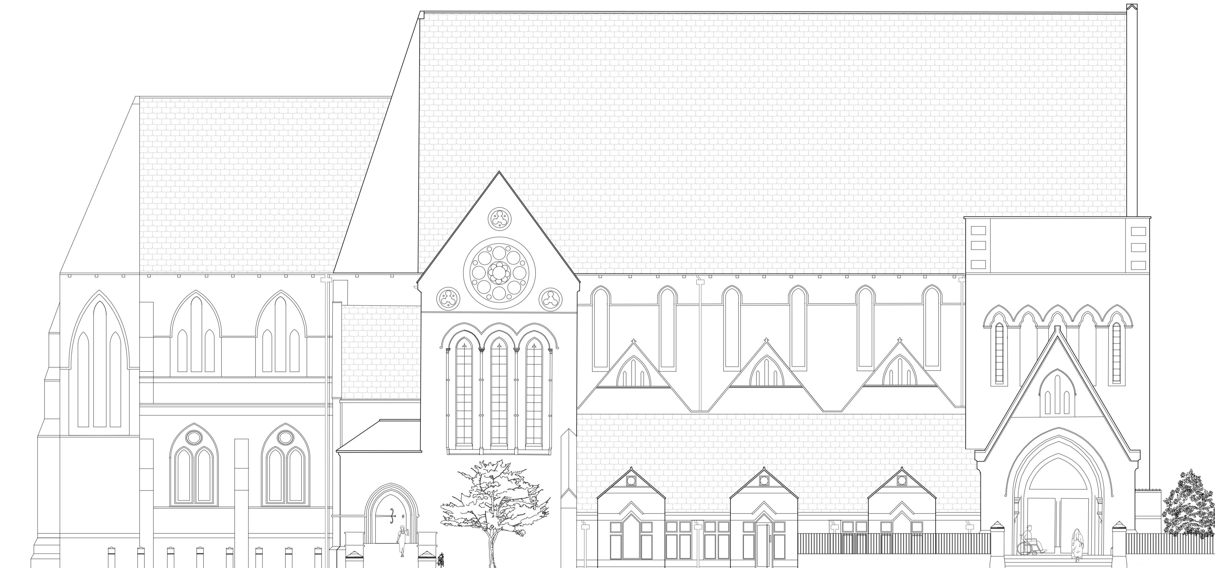
EXISTING CLARENCE STREET ELEVATION