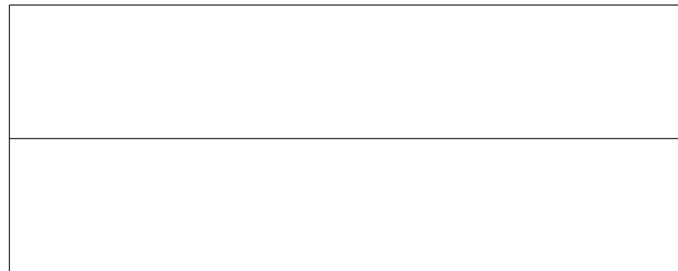
PROPOSED ROOF PLAN (1:100)