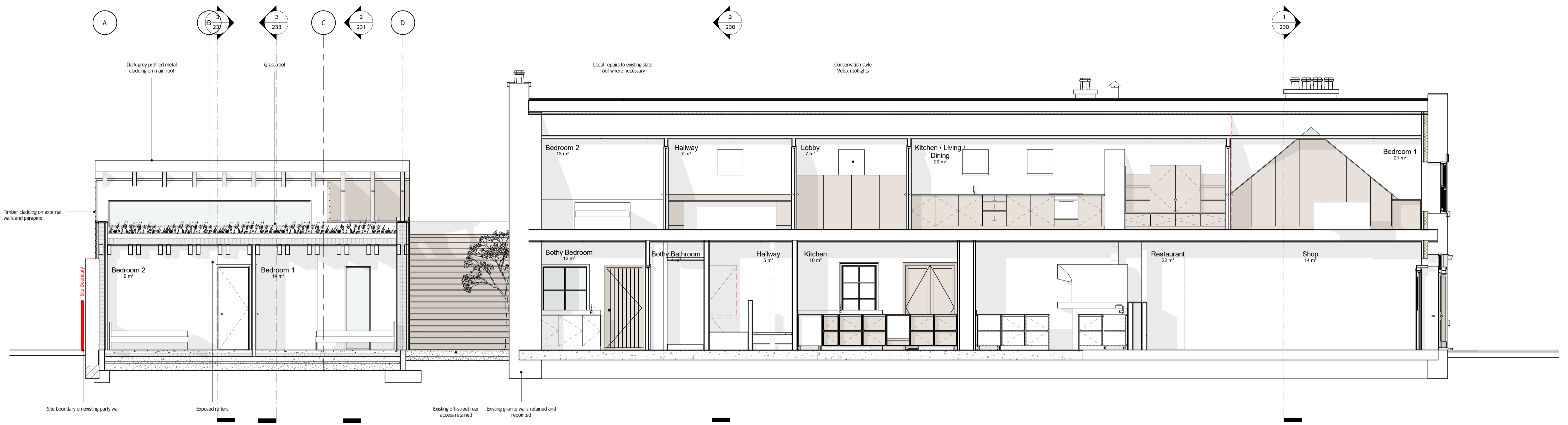
1 Section 5 - Through New Build Accommodation 1:50