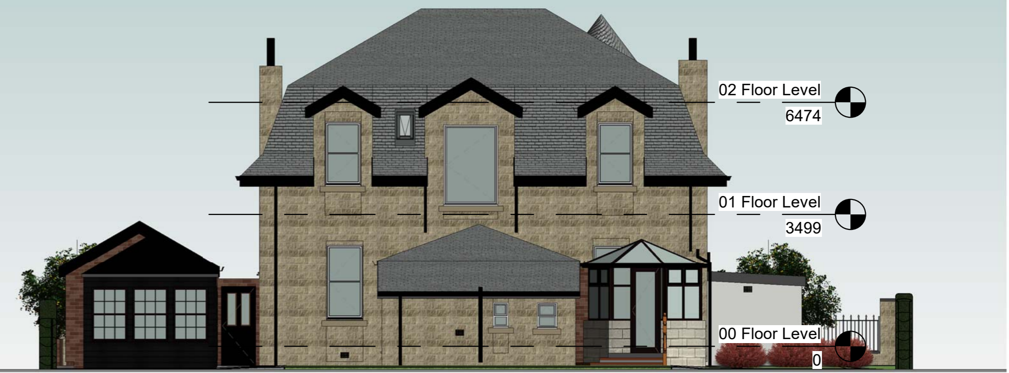
3 Existing Rear Elevation 1:100