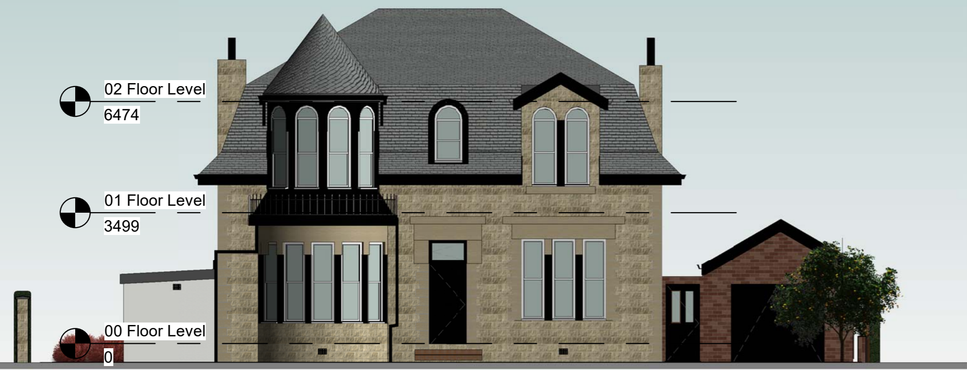
1 Existing Front Elevation 1:100