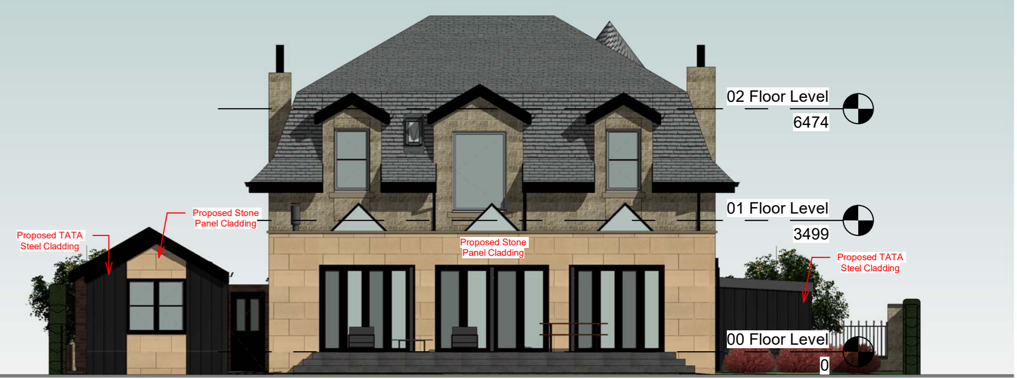
2 Proposed Rear Elevation 1:100