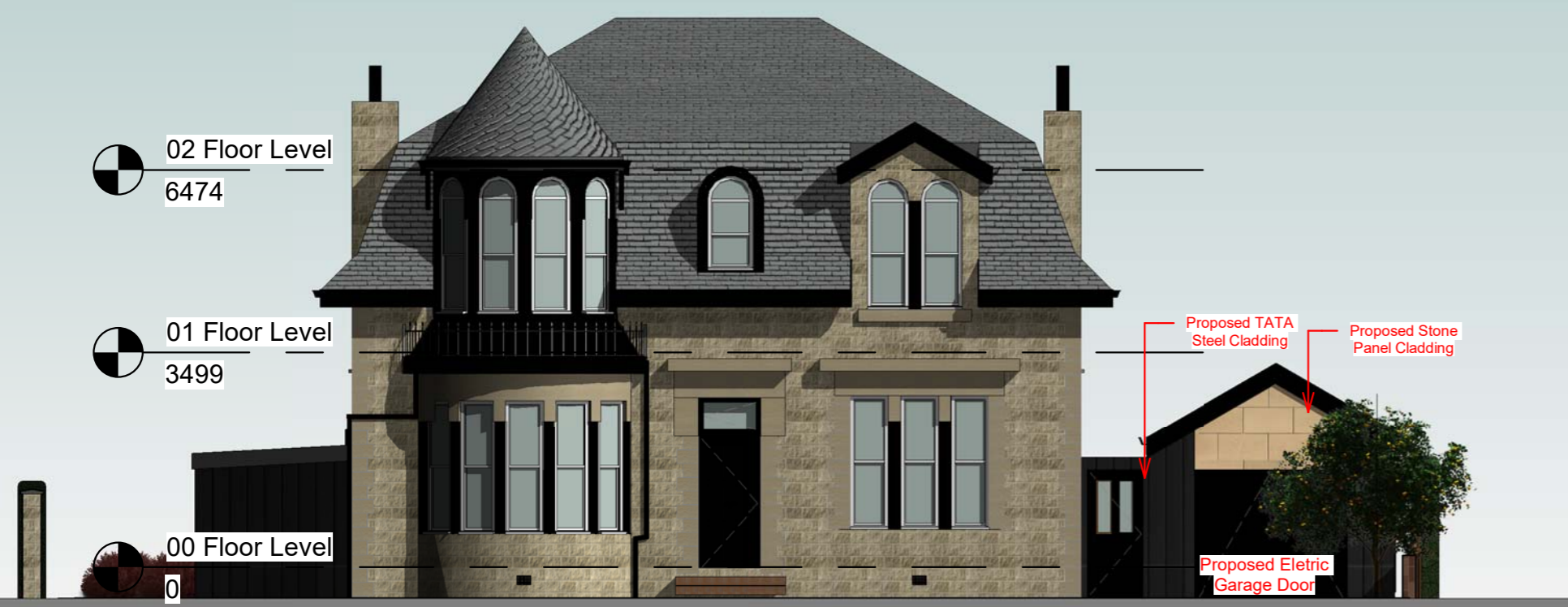
4 Proposed Front Elevation 1:100