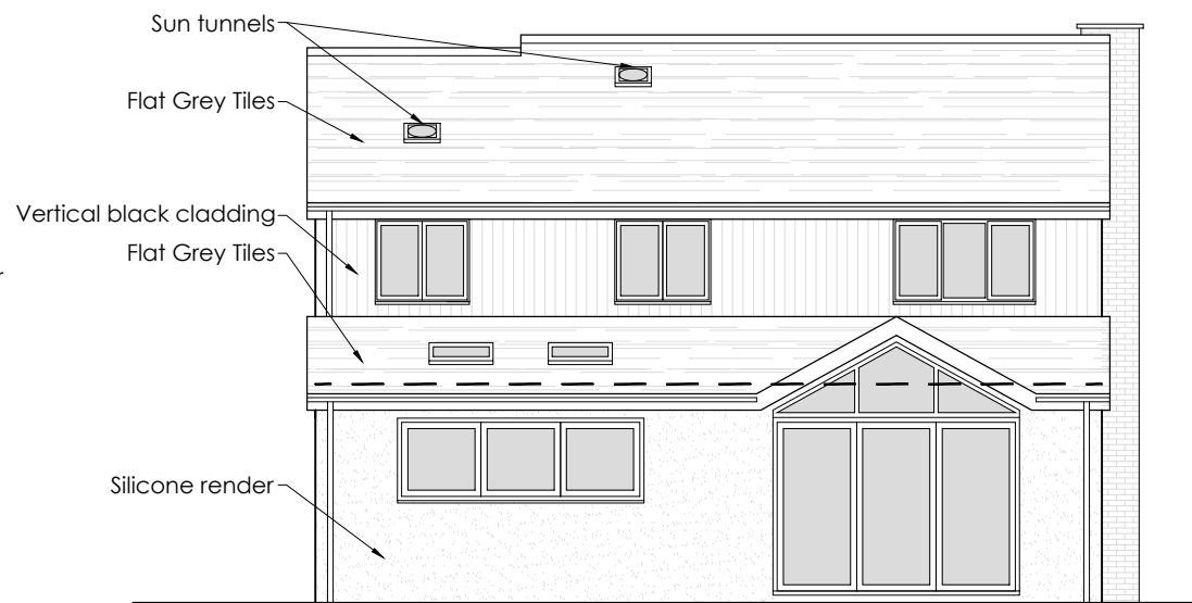
Rear Elevation 1:100 All dimensions to be checked on site