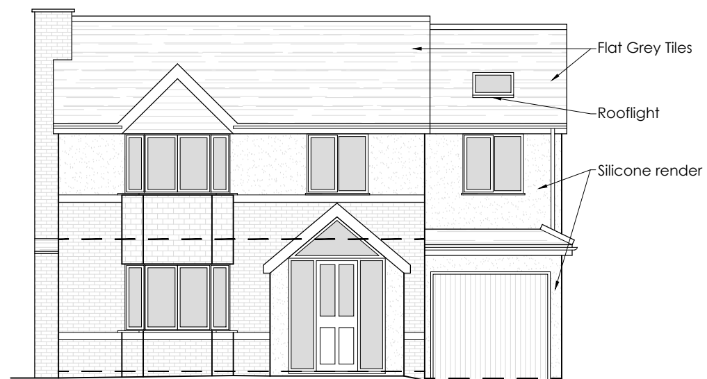
Front Elevation 1:100 All dimensions to be checked on site