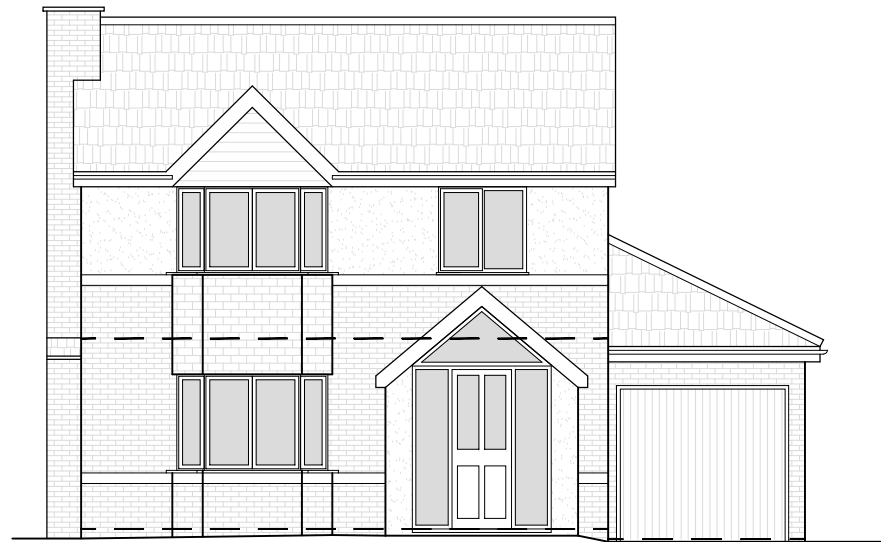
Front Elevation 1:100 All dimensions to be checked on site