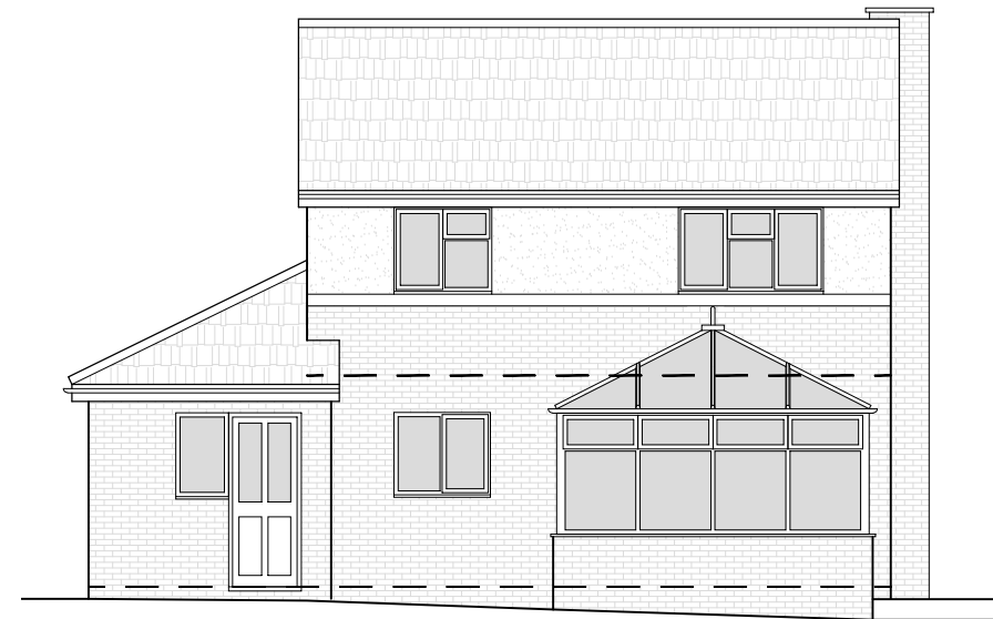
Rear Elevation 1:100 All dimensions to be checked on site