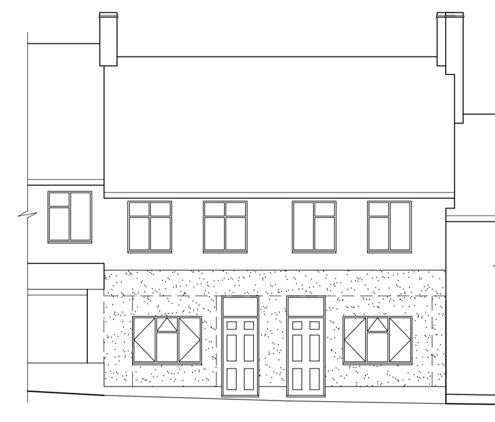
FRONT ELEVATION (1:100)