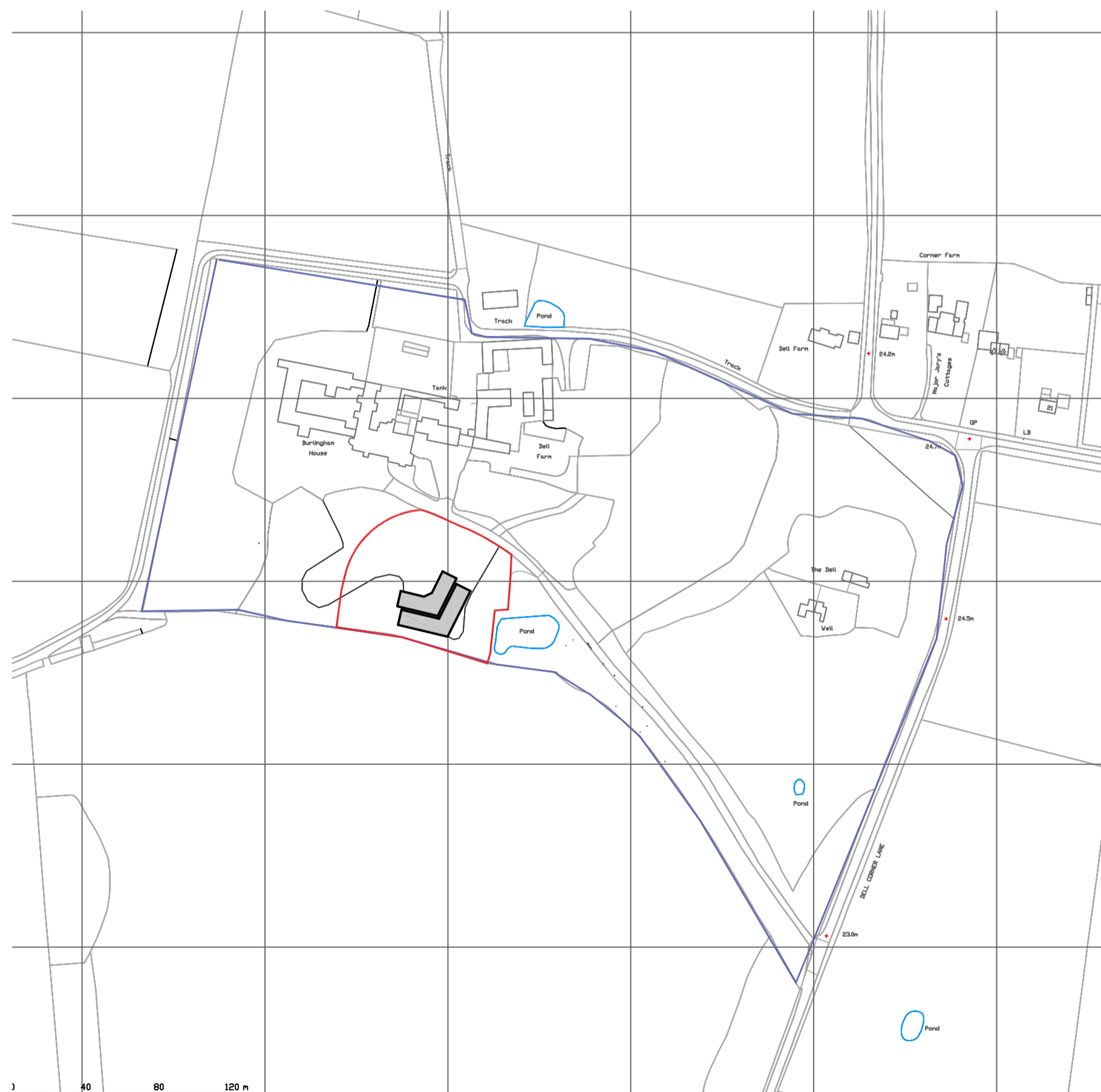
PROPOSED LOCATION PLAN - 1/2500