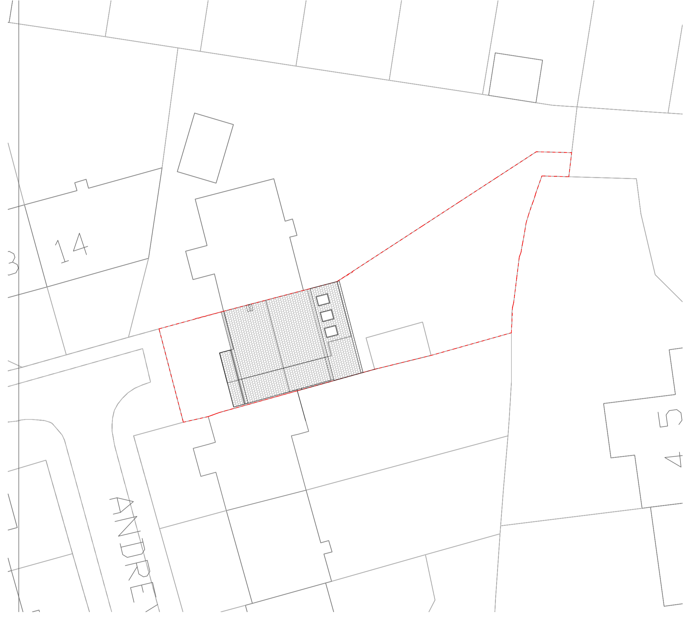
Proposed Block Plan Scale 1:200