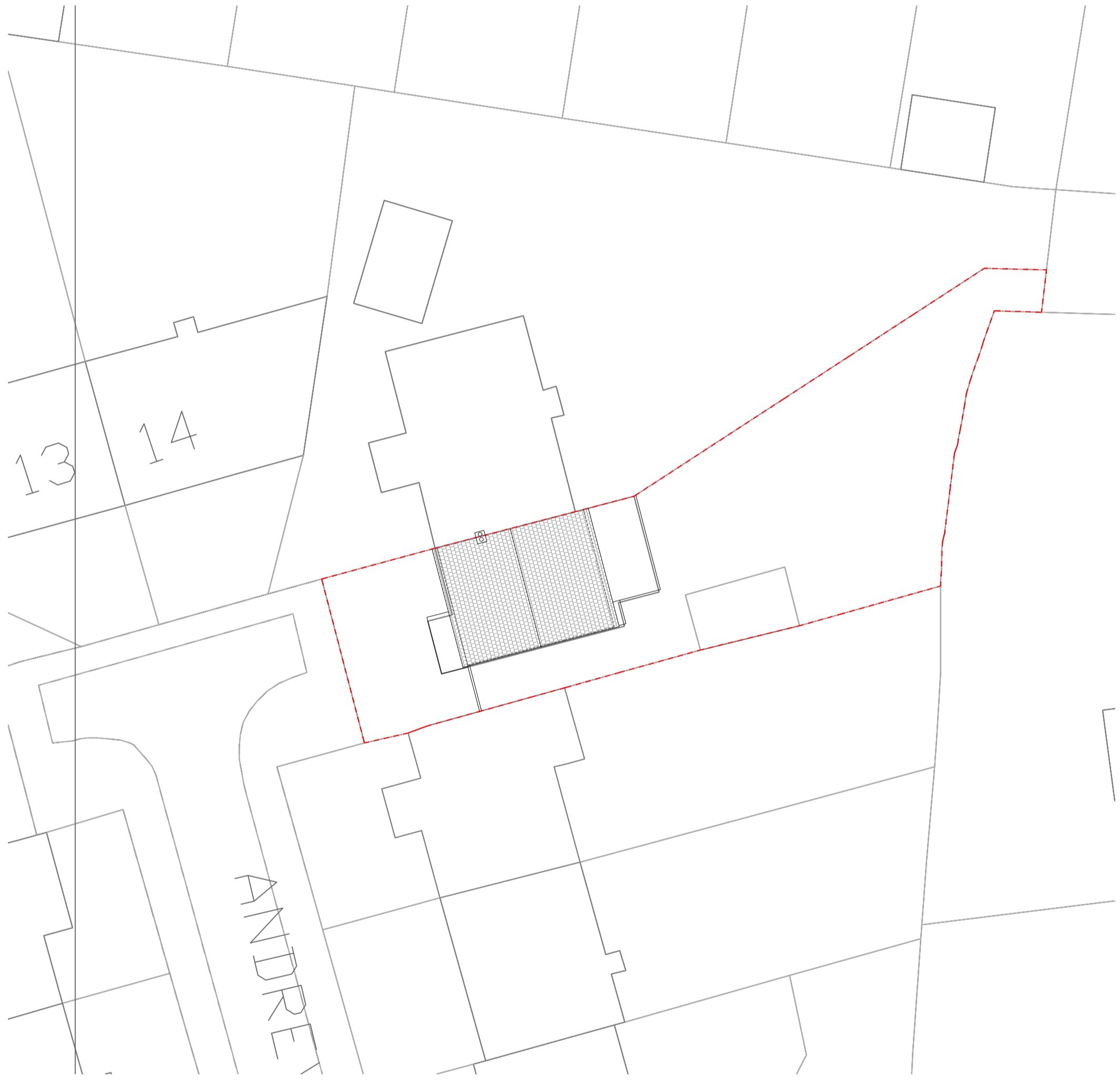
Existing Block Plan Scale 1:200

234 Green Lane, London, SE9 3TL +44 (0)208 064 22 50 info@khdarchitecture.com