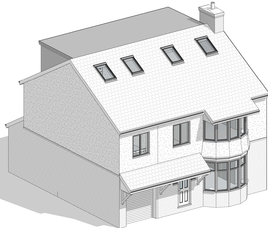
Proposed 3D - Front