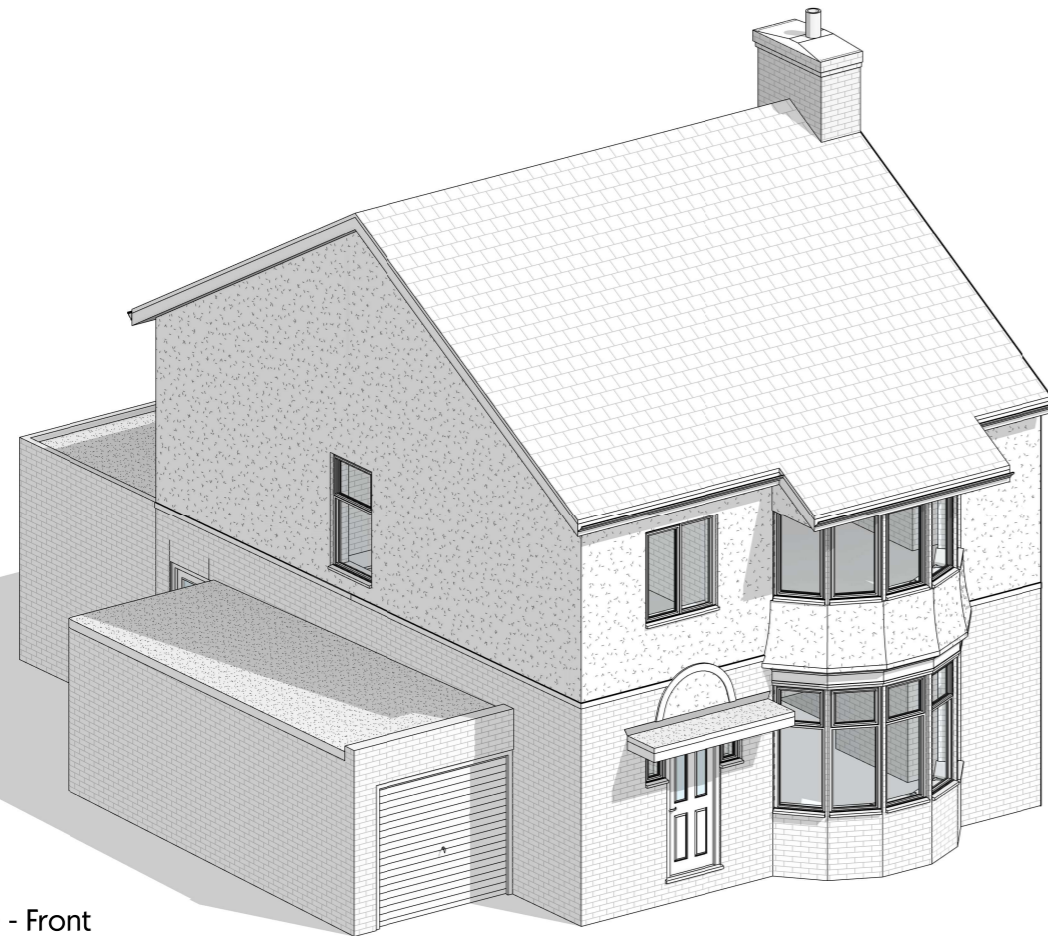
Existing 3D - Front