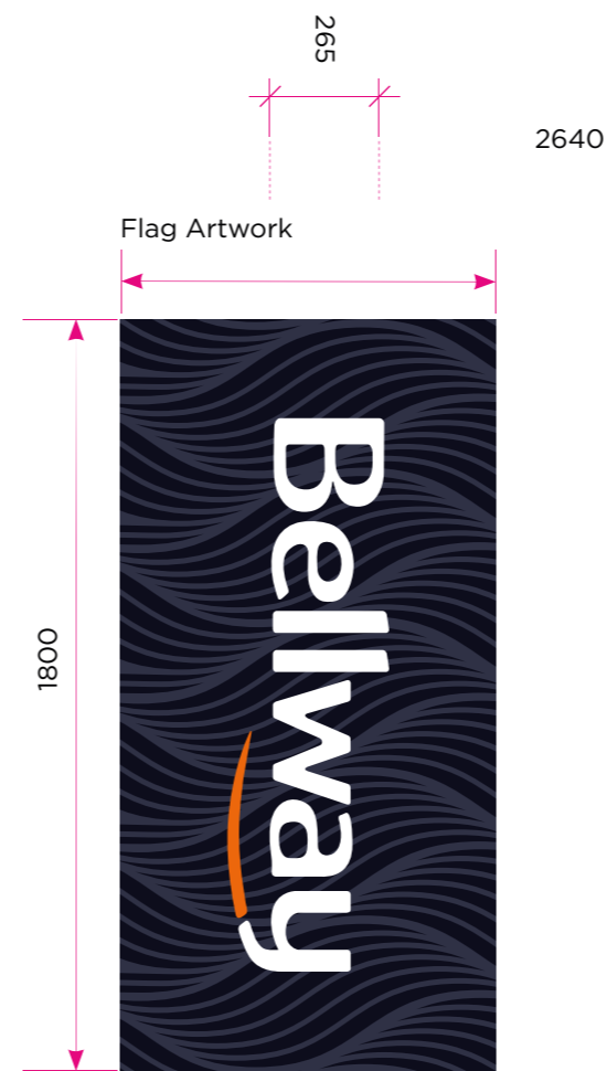
Front Elevation all dimensions in mm