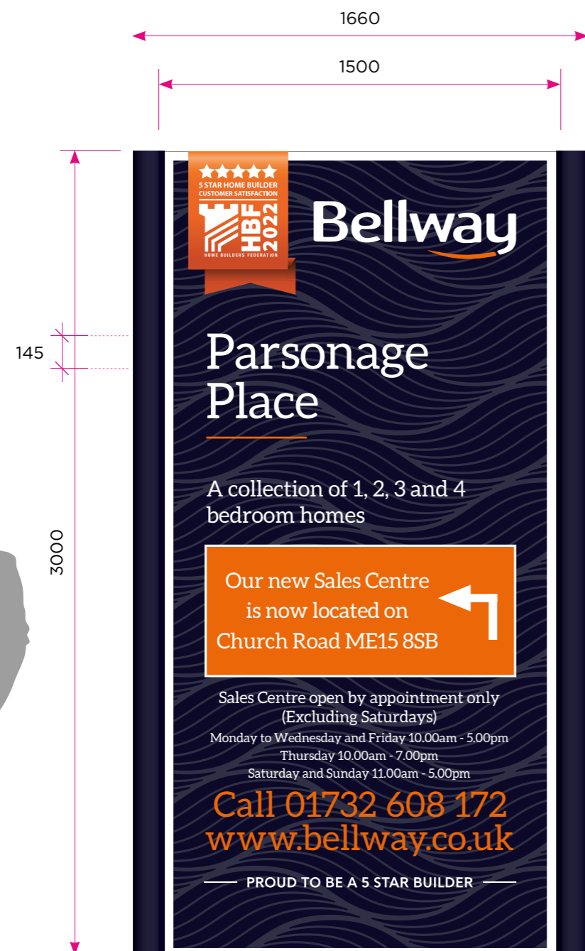
Front Elevation - Scale - 1/20@A3 all dimensions in mm

Posts sleeved over 80x80x6.3mm mild steel SHS which are dug into foundation groundworks and filled with post fix concrete