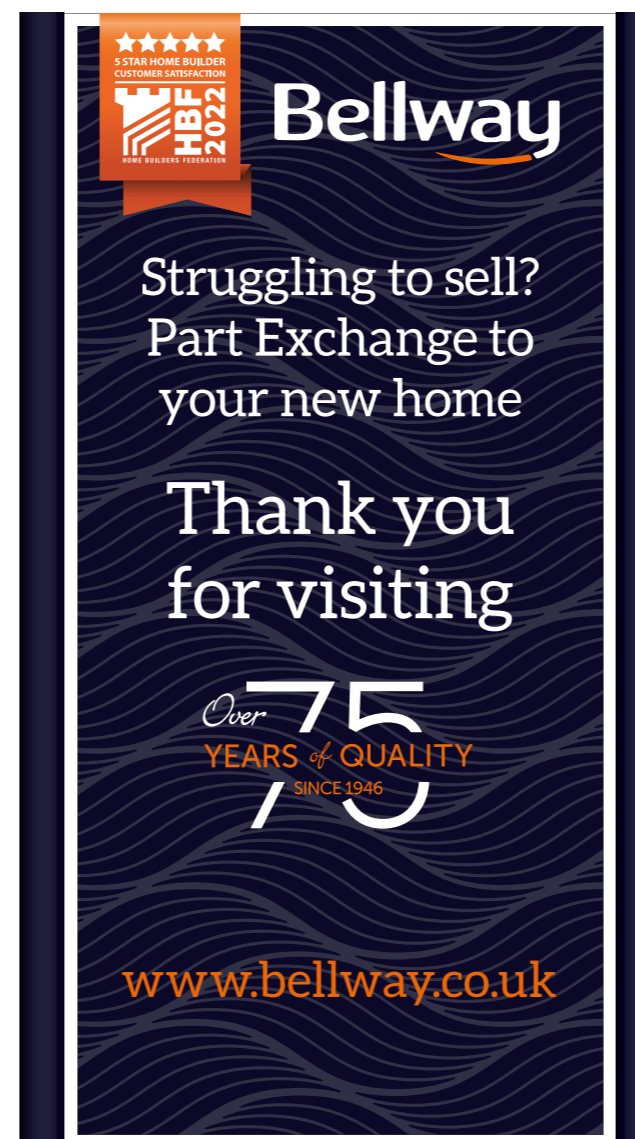
Rear Elevation - Scale - 1/20@A3 all dimensions in mm