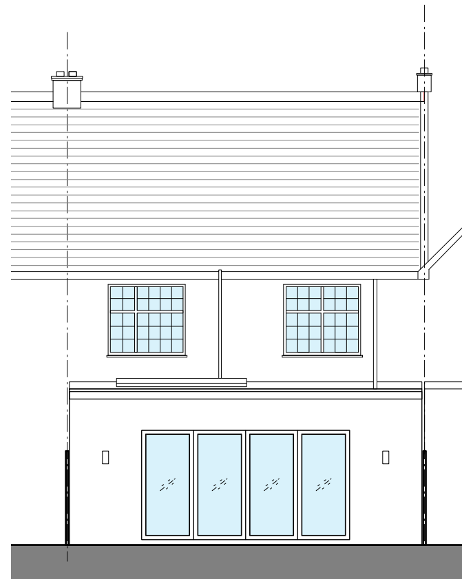
2 Proposed Rear Elevation Scale: 1:100

Revisions A - 30.11.23 Issued for Planning