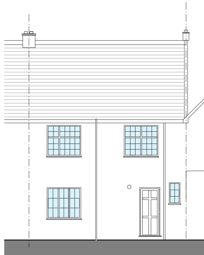
1 Existing Rear Elevation Scale: 1:100