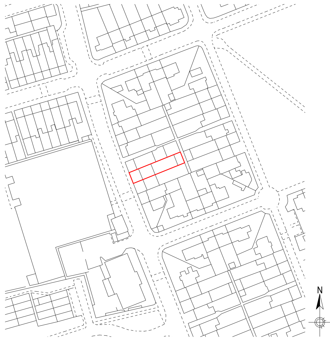
1 Site Location Map Scale: 1:1250