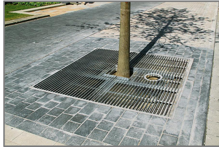
TREE GRILLE - Versa 'Metro City' 1400(l)x1400(w)