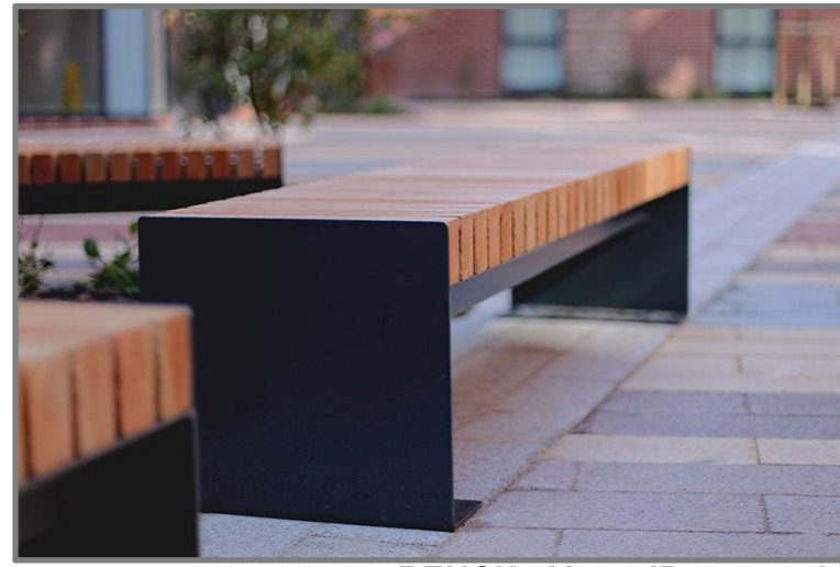
BENCH - Versa 'Burscough' 1920(l)x480(w)x440(h)