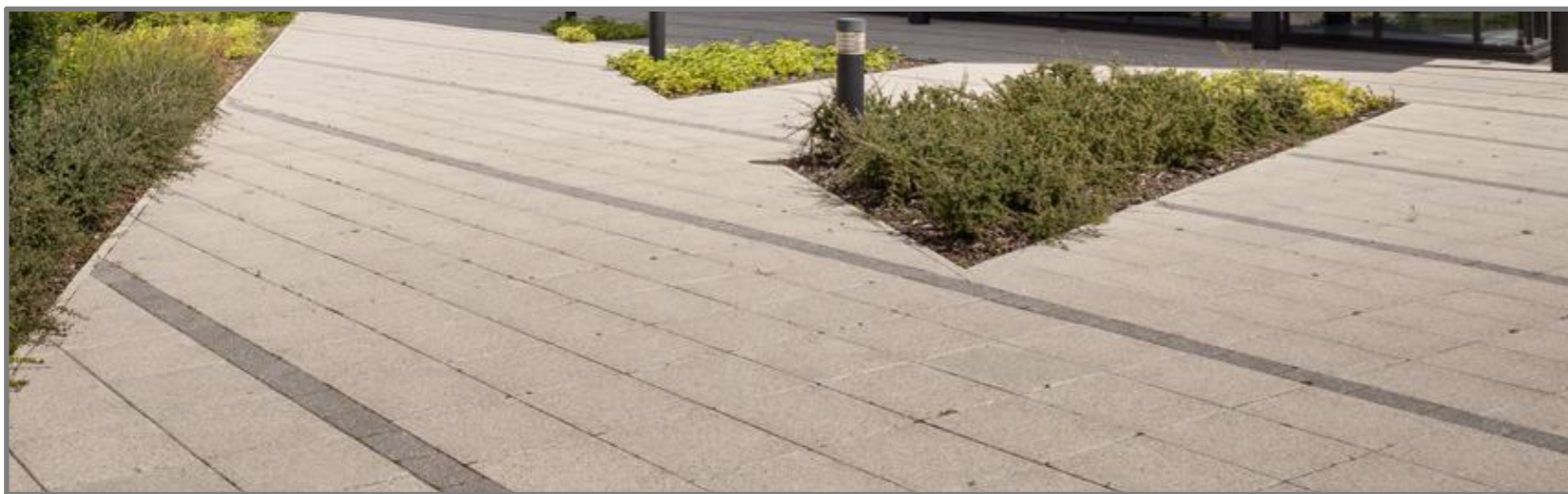
PAVING SETS - Marshalls 'Mistral Charcoal' 160(l)x160(w)