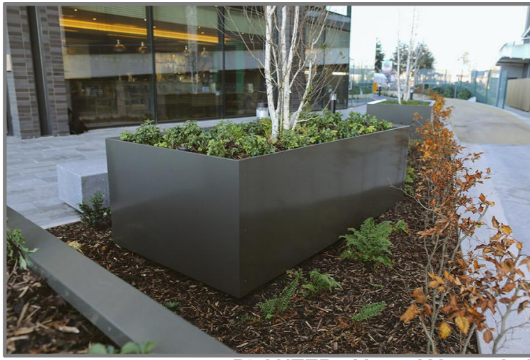
PLANTER - Versa 'Alexander' 2800(l)x500(w)x500(h)