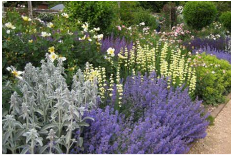
SOFT LANDSCAPING - Native planting mix