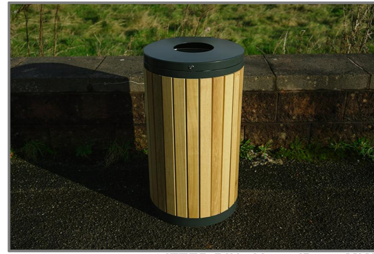
LITTER BIN - Versa 'Dune MK2' 500(dia)x890(h)