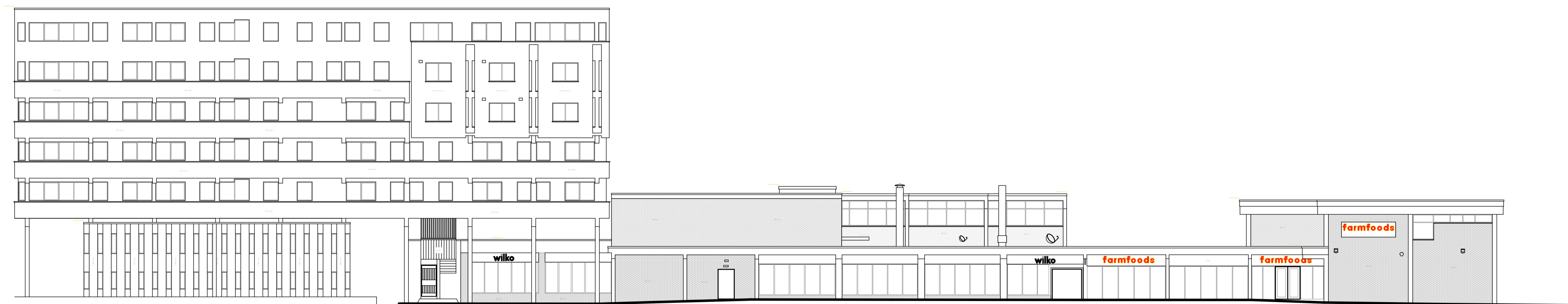
EXISTING SOUTH ELEVATION (SHOPPING PARADE) 1:200@A1