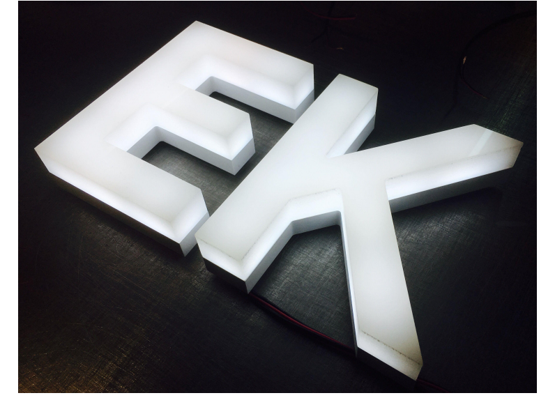
SIGNAGE TYPE EXAMPLE Fully illuminated, built-up, acrylic LED signage letters Letters to project 100mm

SIGNAGE LOCATION 'D' Fully illuminated, built-up, acrylic LED signage letters on Trespa Meteon (or similar) grey fibre cement cladding panel Letters to project 100mm Ground level to underside of signage letters = 2.9m