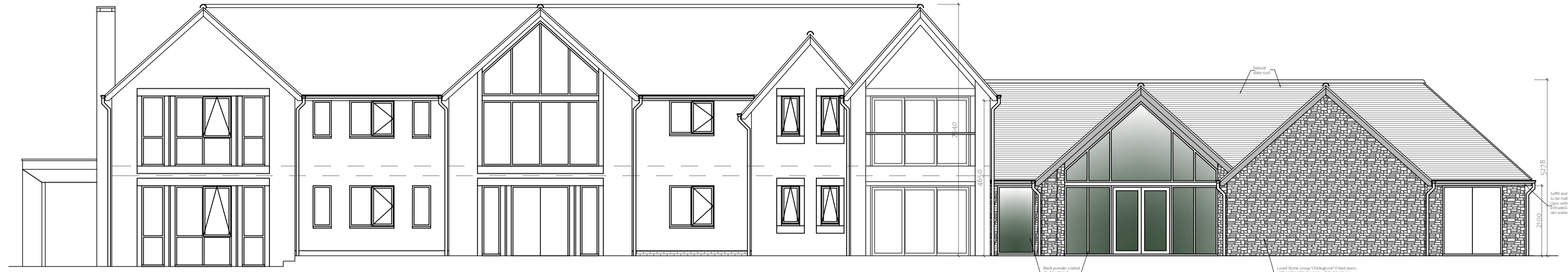
Proposed Front Elevation Scale 1: 100 (East)