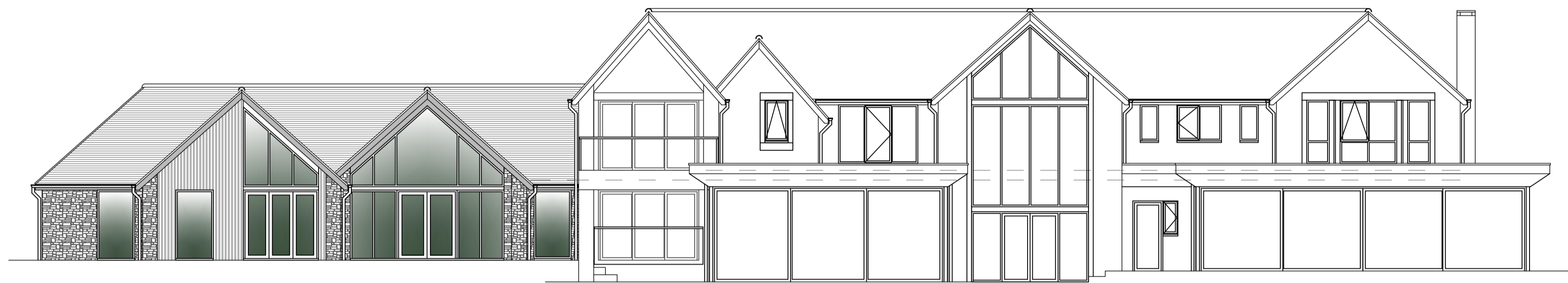
Proposed Rear Elevation Scale 1: 100 (West)