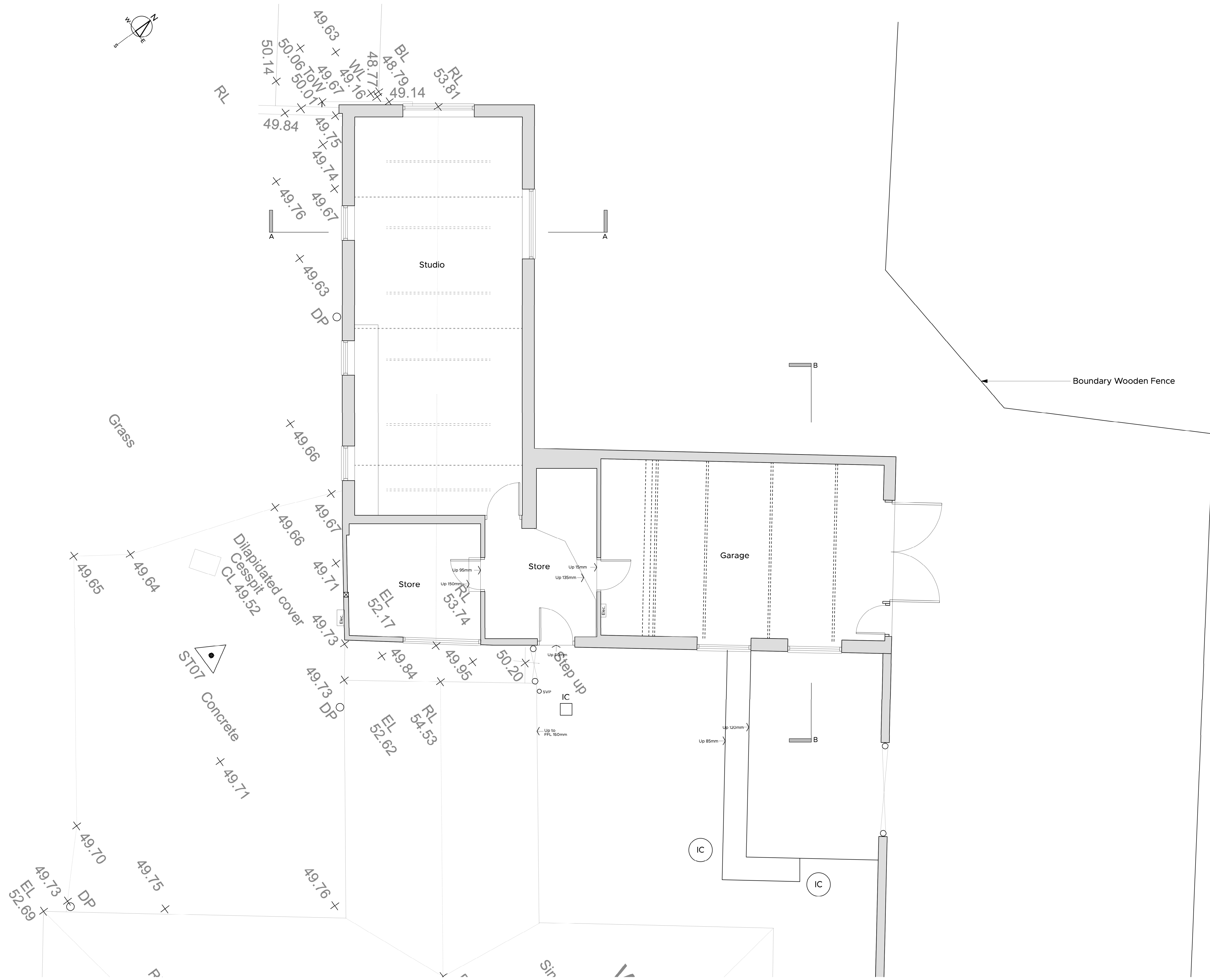
Existing Floor Plan Scale: 1:50