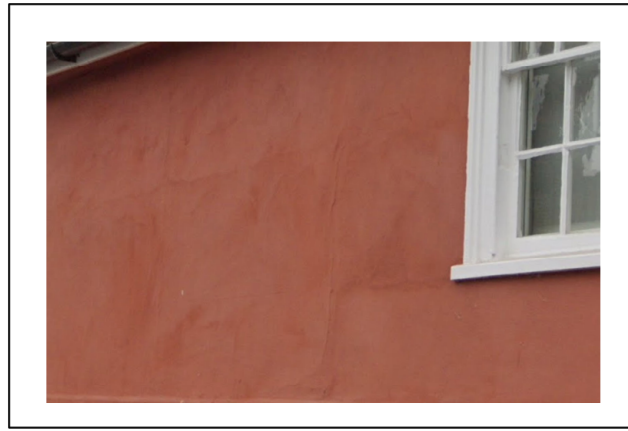
Render starting to crack around window frames