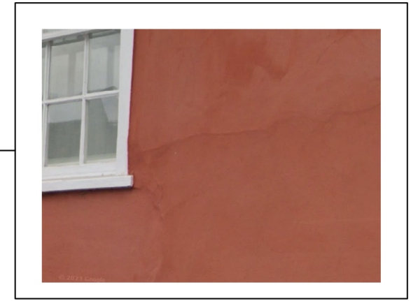
Render starting to crack around window frames