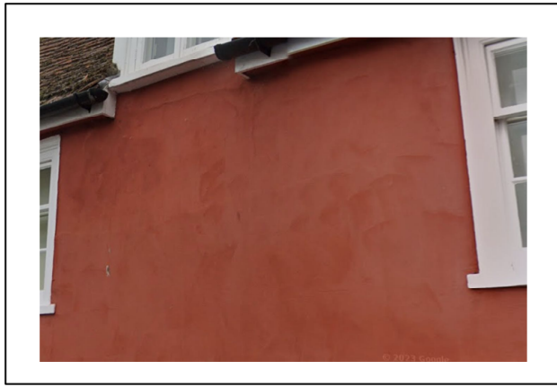
Render starting to crack around window frames and under dormer at the eaves.