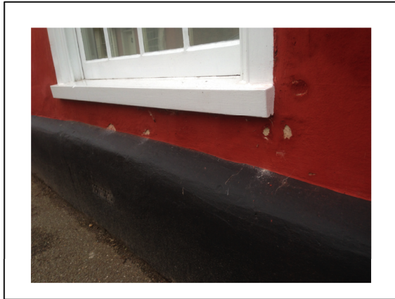
Noticeable damage to render under cill which will be repaired by proposal