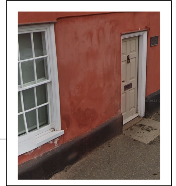
Paint fading and staining brick plinth caused by badly draining gully. To be repaired

North Other elevations remain unaffected