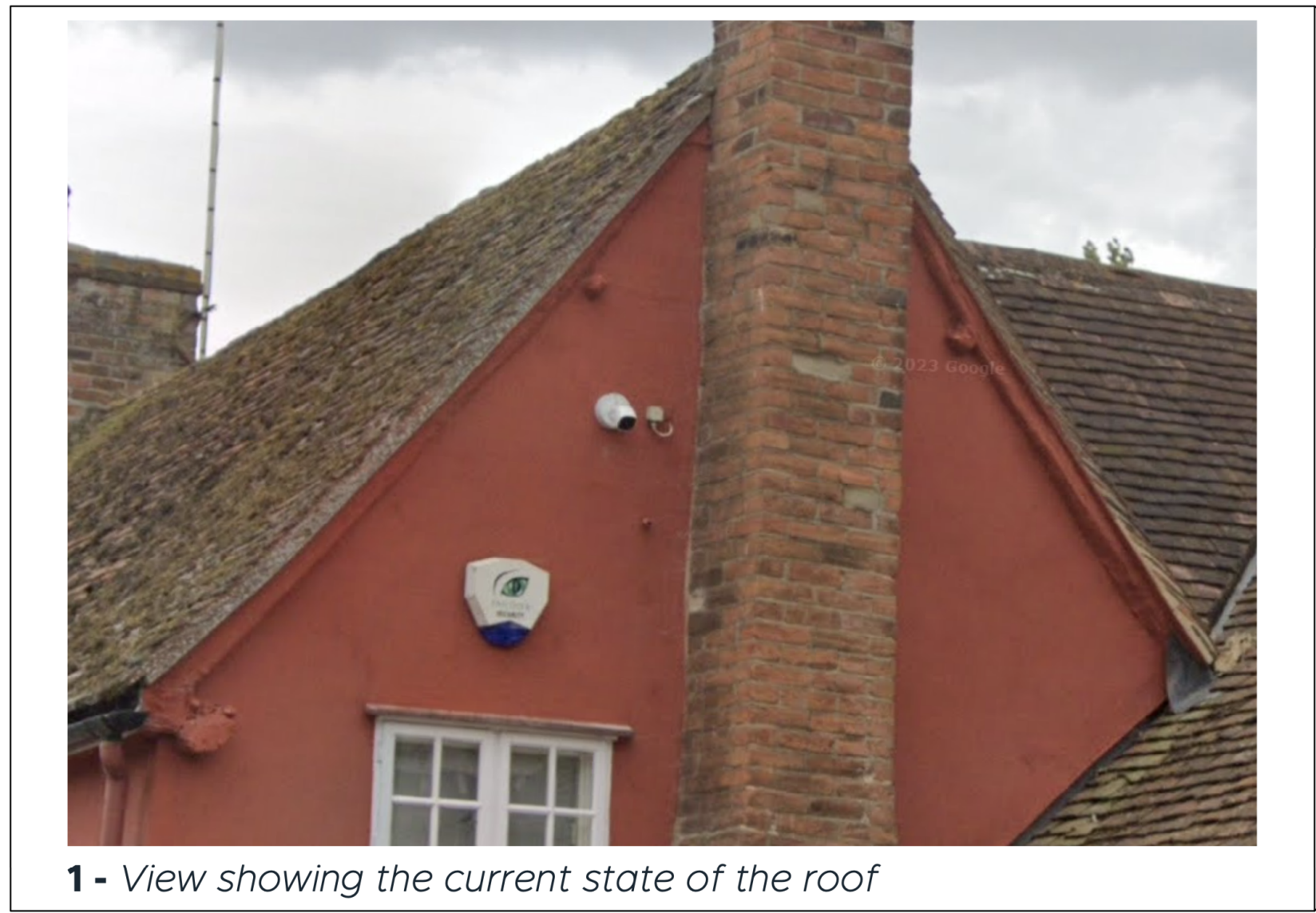
1 - View showing the current state of the roof

Dashed line indicates the extent of the alterations