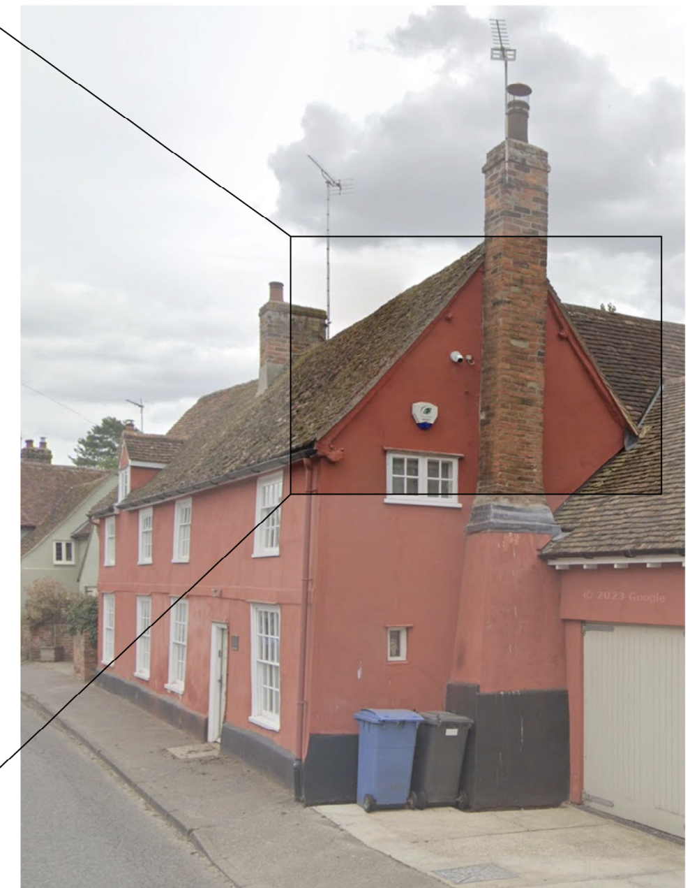
Image shows the difference between the edge tiles of the altered end of the gable and the current northern roof face. Roof tile will have the same profile as the plain tiles on the altered sections which have been chosen to match the existing.