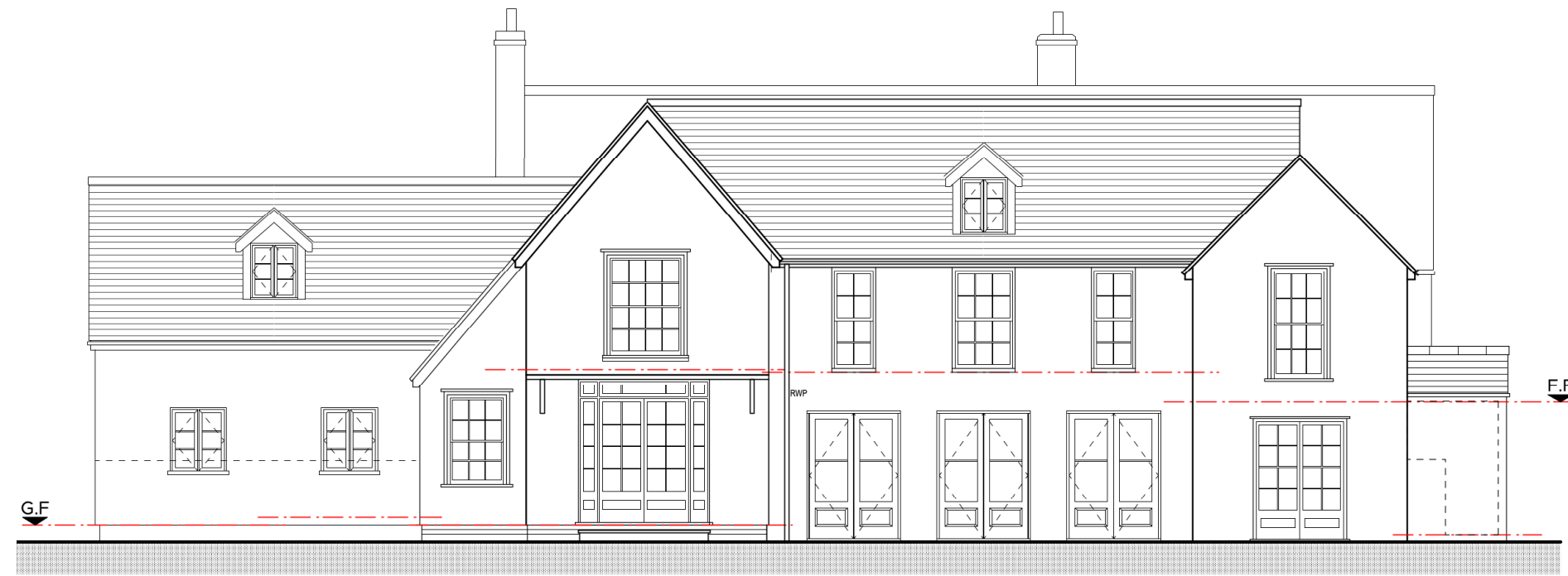
EXISTING REAR ELEVATION South