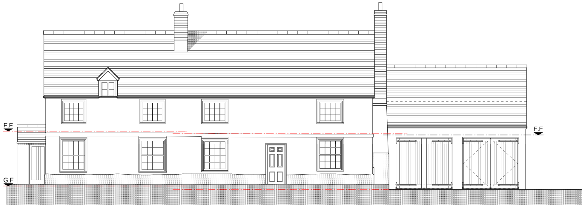
EXISTING FRONT ELEVATION North