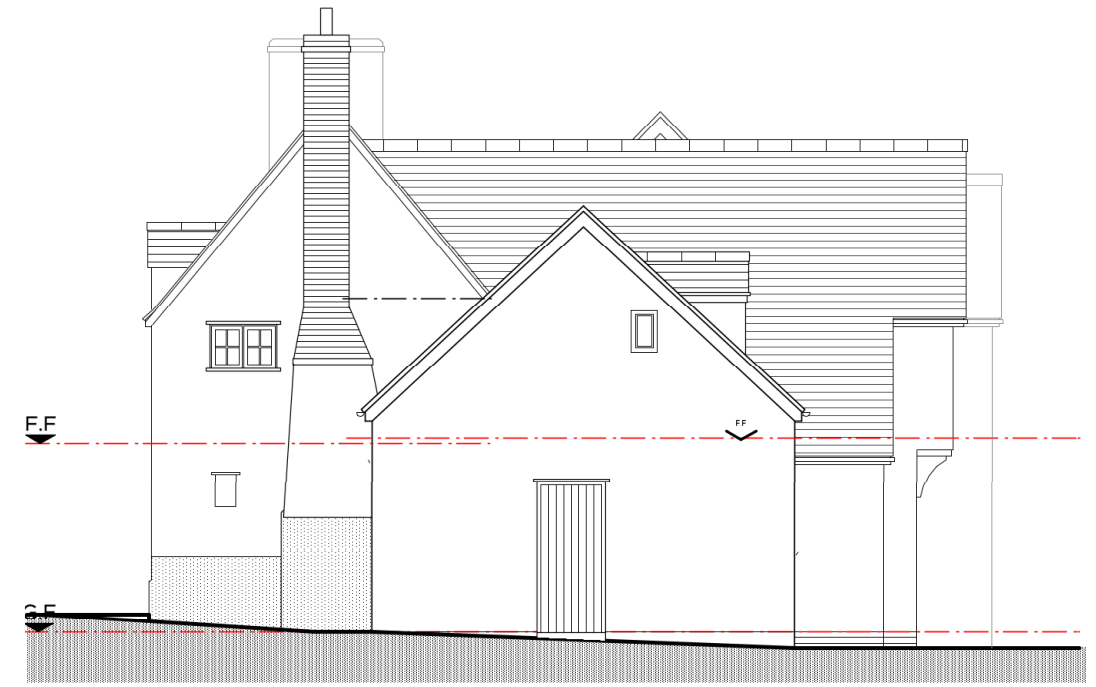
EXISTING SIDE ELEVATION West