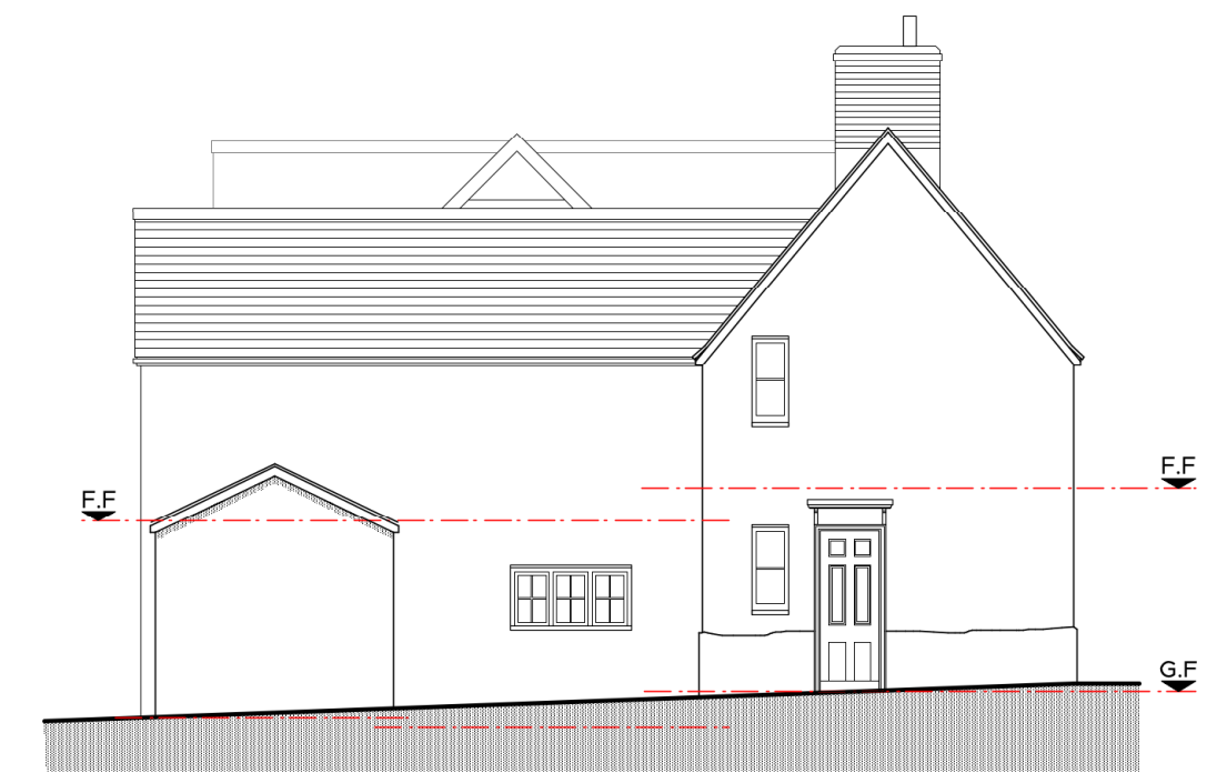
EXISTING SIDE ELEVATION East