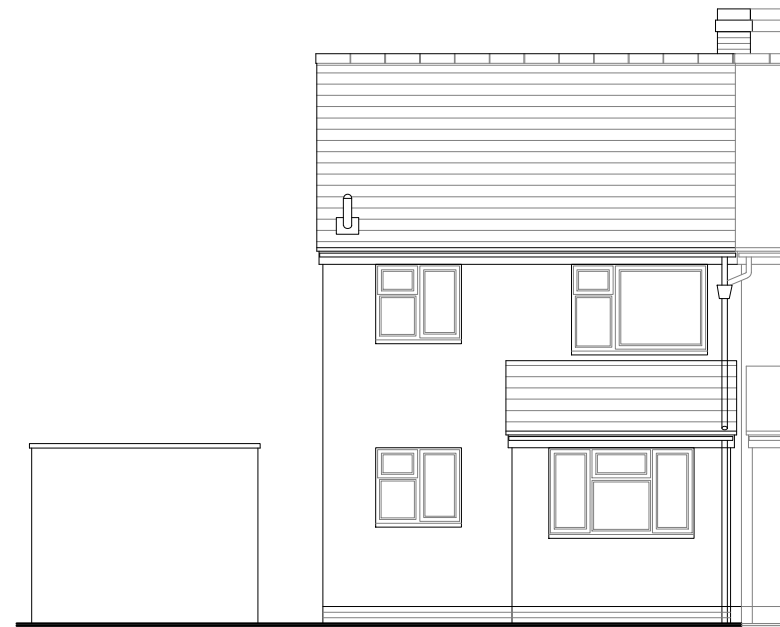
Existing Rear Elevation (1:100)