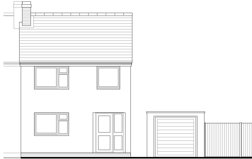
Existing Front Elevation (1:100)