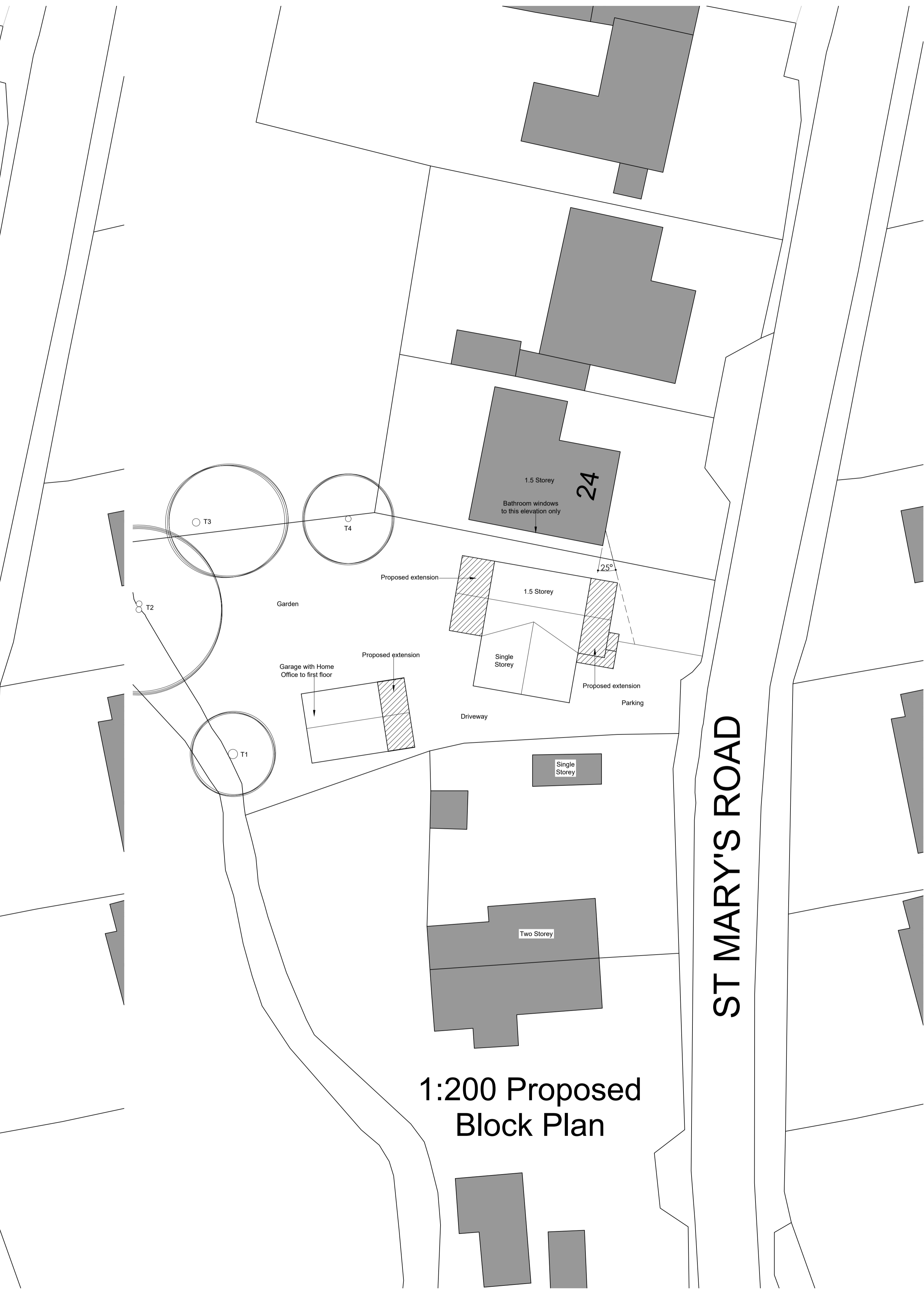
1:200 Proposed Block Plan