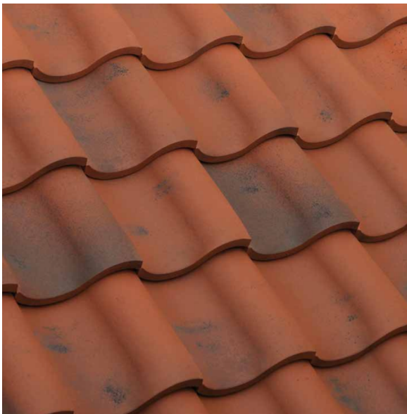
Proposed Marley Lincoln Clay Pantiles colour rustic red

6) Notwithstanding the proposed use of Marley Lincoln Clay Pantiles colour rustic red, prior to works above slab level to the cart lodge or stable block, details of the proposed roof tiles for the cart lodge and stable block shall be submitted to and agreed, in writing, by the Local Planning Authority and shall be implemented and completed in its entirety as approved.