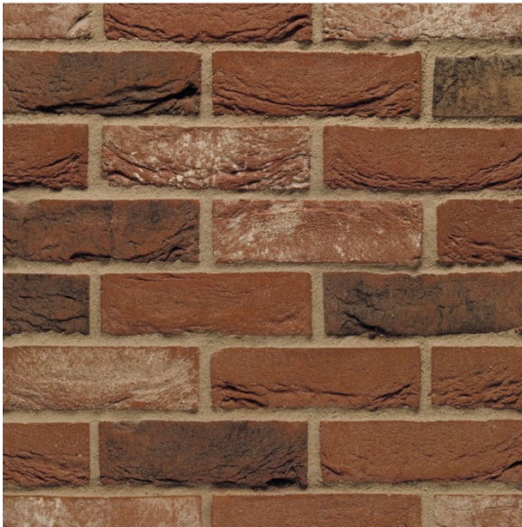
Proposed Wienerberger Mardale Antique brick

5) Notwithstanding the proposed use of Wienerberger Mardale Antique brick, prior to commencement of works above slab level to the cart lodge, details of the proposed bricks for the plinth and cart lodge shall be submitted to and agreed, in writing, by the Local Planning Authority and shall be implemented and completed in its entirety as approved.