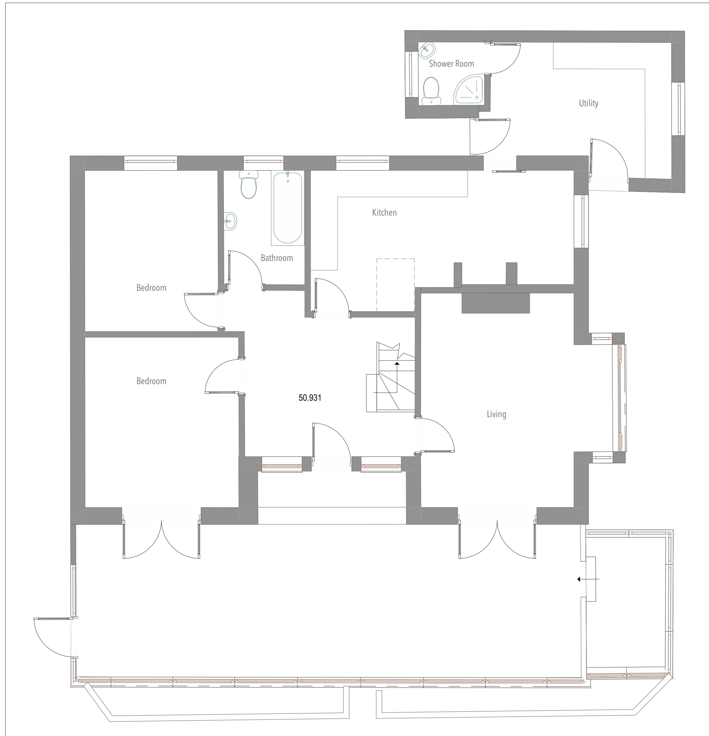
Proposed Ground Floor Plan 1:50