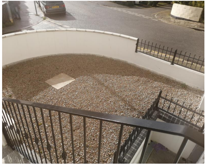
Front yard to no 15

This is an in town site & the front yard to each property is small & there is very little scope for a maintenance of a green garden.